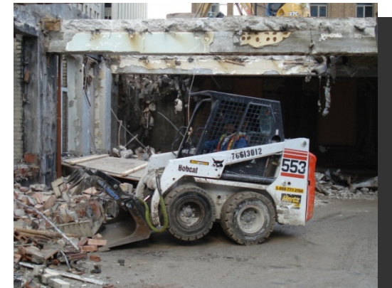
SKID STEER LOADER