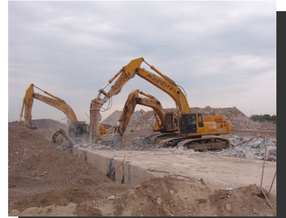
EXCAVATORS EQUIPPED WITH SHEAR, GRAPPLE, HAMMER & HIGH-REACH BOOM ATTACHMENTS