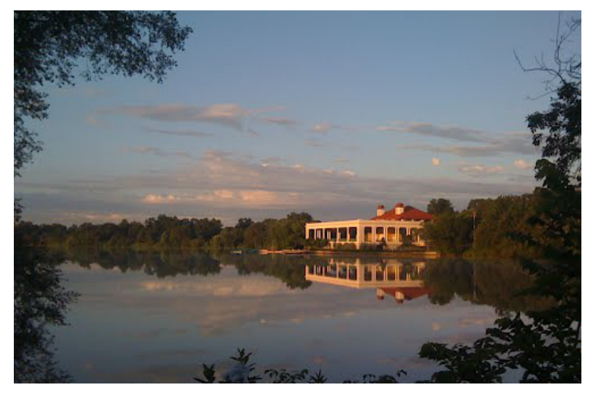
PRK 3.4 Support efforts to restore the Kaufman Cascade

PRK 3.3 Support efforts to restore the Mannheim Memorial Steps