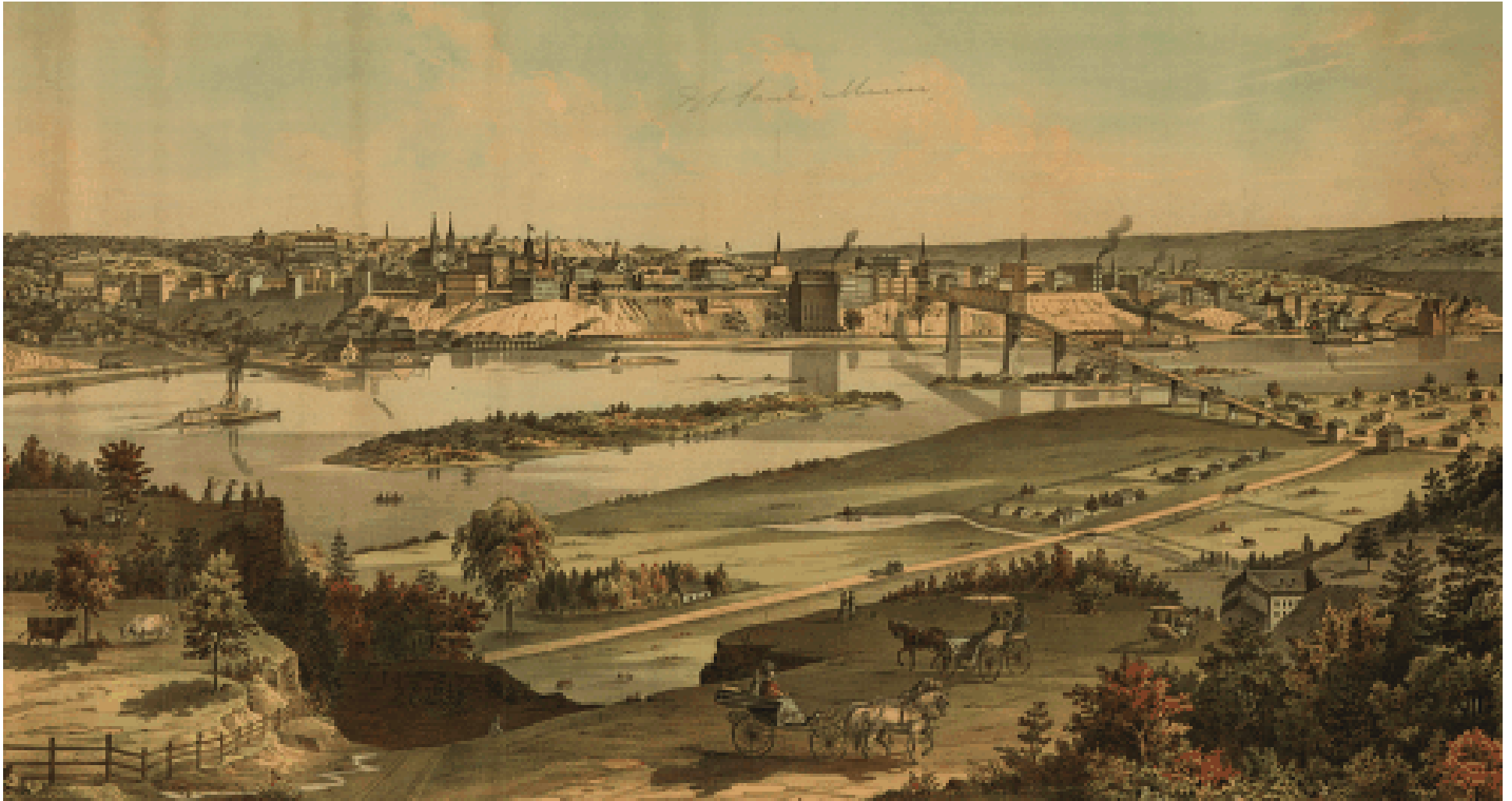
Photo 5. Note relationship of floodplain to downtown. City on the hill. Bluffs surrounding floodplain with no tall buildings. MHS.