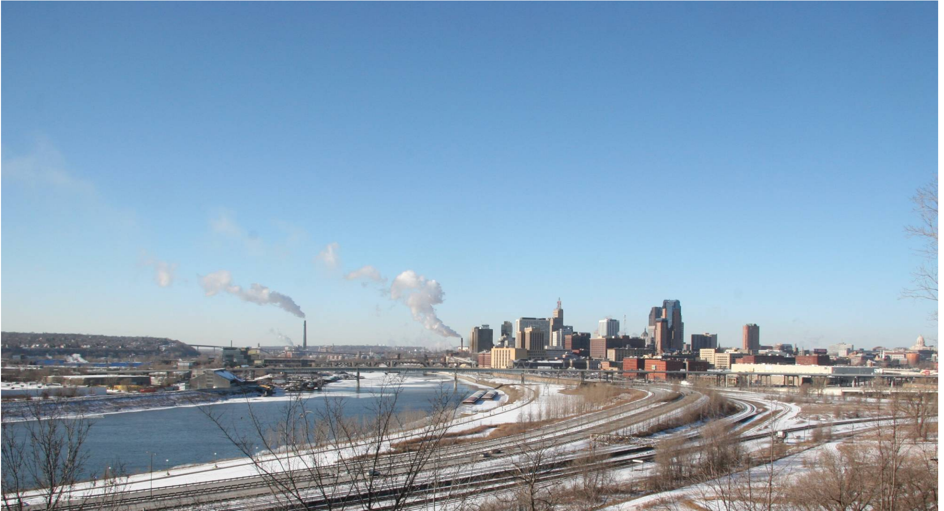
Photo 4. Overall, the relationship of downtown to West Side has remained the same for over 150 years.