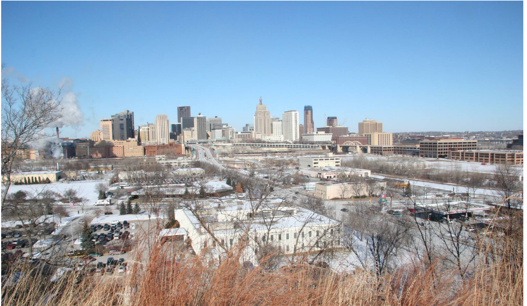
Photo 7. Note again the relationship of buildings on the West Side to those downtown. MNRRA.