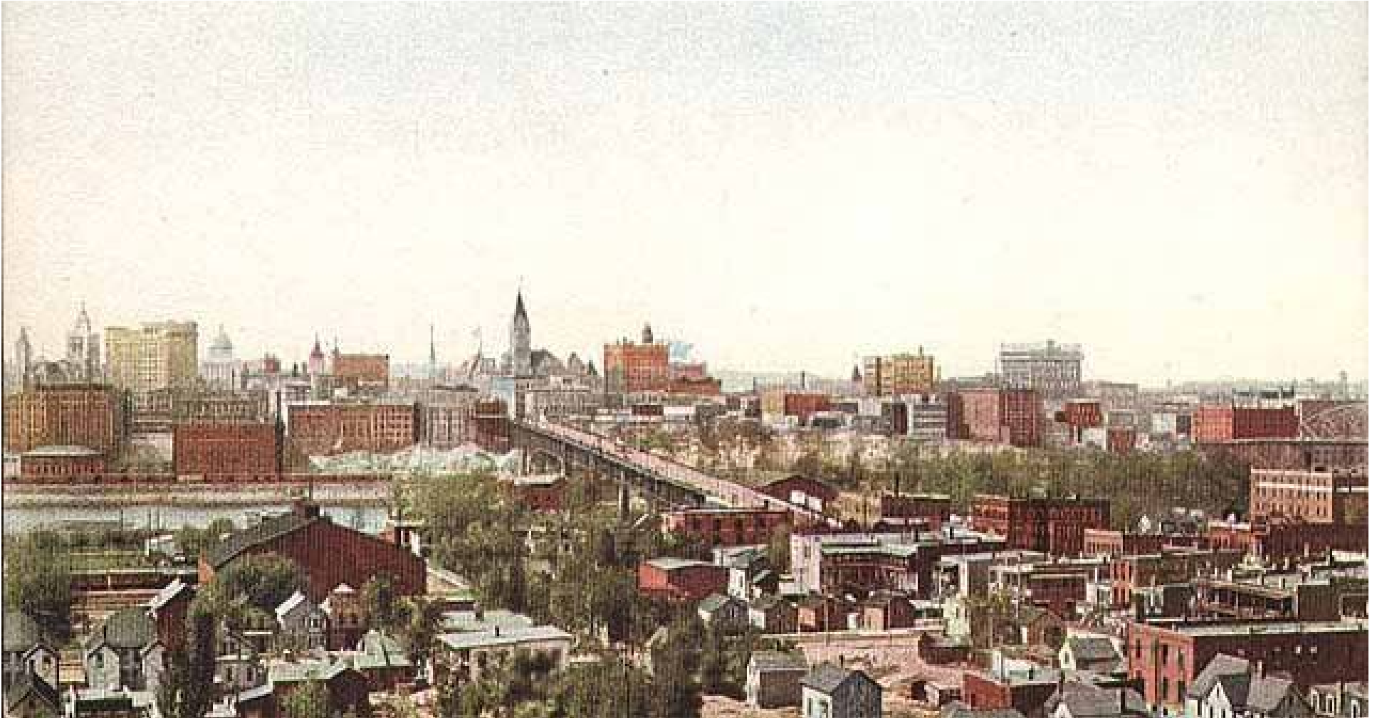
Photo 6. Note the relationship of buildings on the West Side to those downtown.