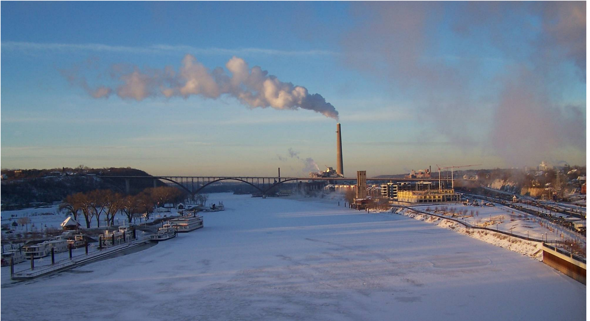
Photo 10. Looking Upstream from next to the Wabasha Bridge.