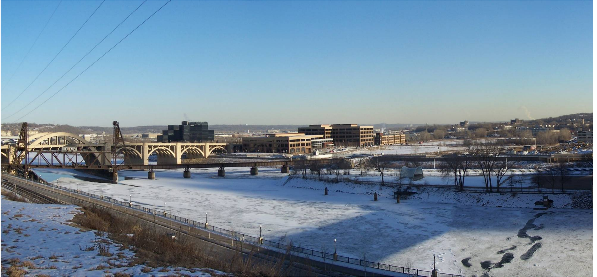
Photo 8. From Wabasha Bridge looking downstream. Note how JLT/Comcast and First Bank Buildings block views. The Bridges Project would completely eliminate this view. MNRRA.