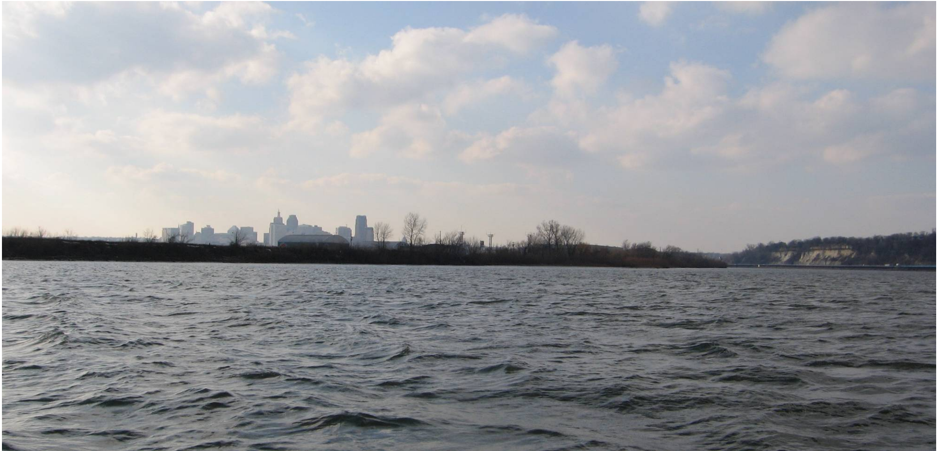
Photo 2. Looking upstream towards St. Paul. MNRRA