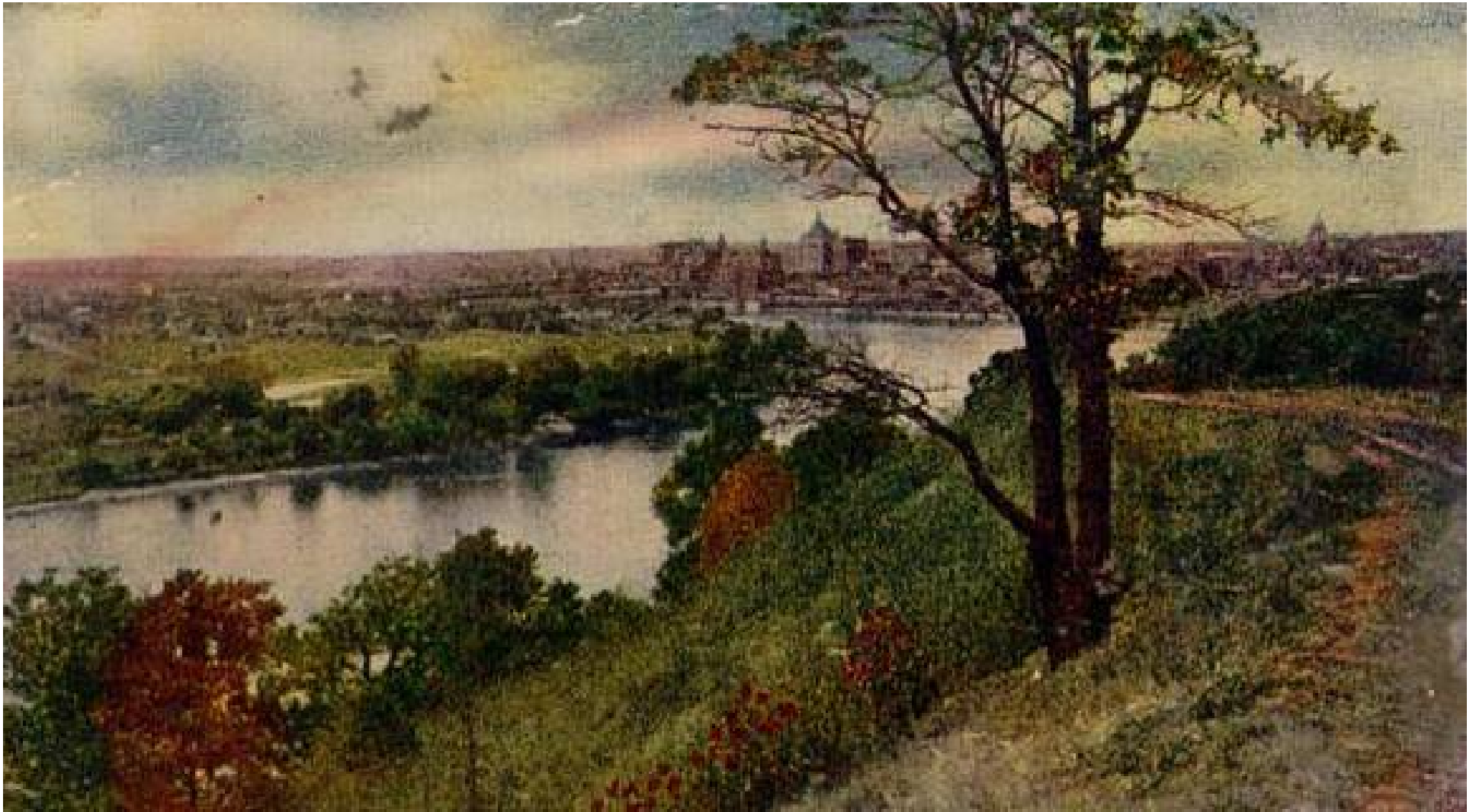
Photo 3. Note the relationship of downtown St. Paul to the West Side.