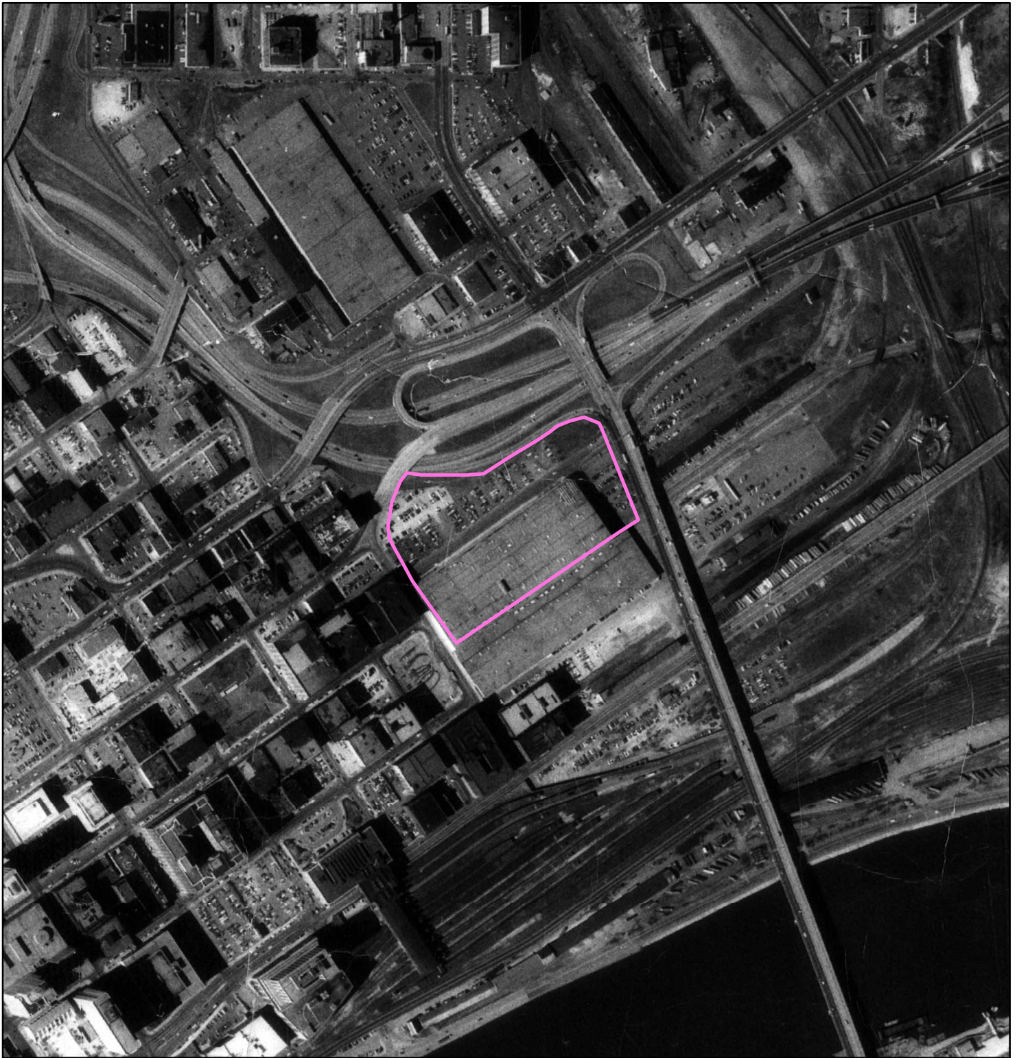
Map adapted from 1978 aerial from Diamond Products Phase I ESA Report