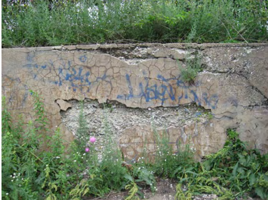
Figure 8. Southern face of the foundation wall, facing northwest