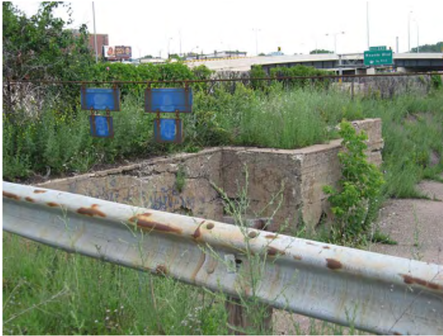
Figure 7. Partial foundation wall, facing northeast