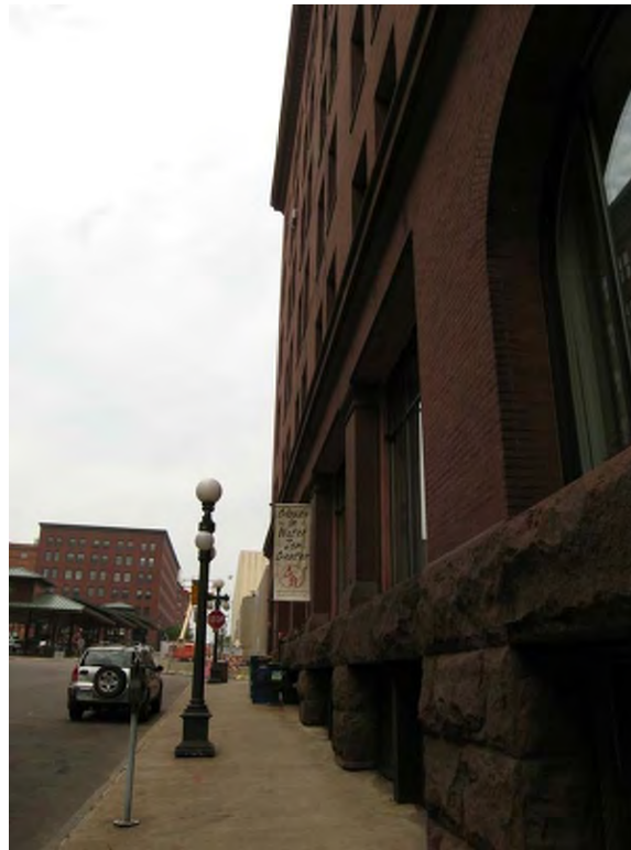
Figure 11. View of Diamond Products Building from Northern Pacific Railway Warehouse, facing north.