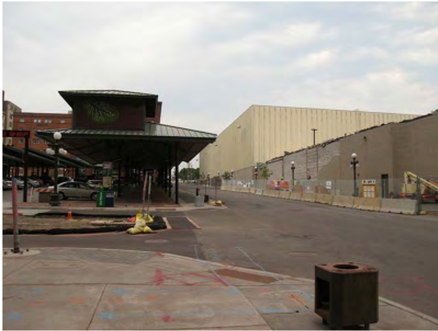
Figure 10. View of Diamond Products Building from St. Paul Rubber Company, facing north.