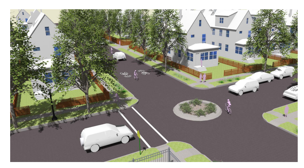
An example of Established Neighborhood Streets from the Street Design Manual

the city. Recommendations in the Action Plan are based on lessons learned while creating the Street Design Manual, associated street design workshops and the East 7th Street Better Block event, which was held in the summer of 2013. The manual and the Complete Streets Action Plan will be adopted in early 2015.