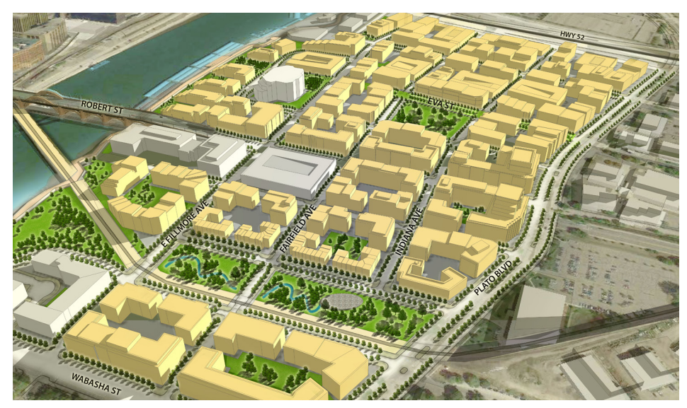
The proposed West Side Flats Greenway will incorporate stormwater management into a new central park space, creating a major amenity in the heart of West Side Flats

vicinities of Union Depot, Mounds Boulevard, Earl Street, Etna Street, White Bear Avenue, and the Sun Ray shopping center. The City of Saint Paul is undertaking a Station Area Planning process in order to take full advantage of this major potential transportation investment. In April 2014, the Planning Commission appointed the Gateway Station Area Planning Task Force and authorized the planning study, which is now underway.