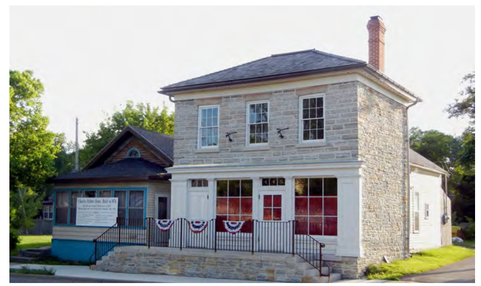
The Stone Saloon located at 445 Smith ave. Saint Paul's first historic use variance.

adopted by the end of 2016, and that subsequent planning and adoption of new ordinances in Saint Paul will take at least one additional year from the time of rule adoption.