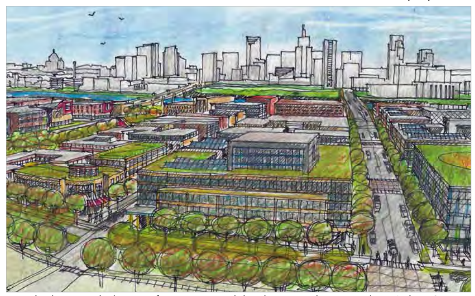
View looking north showing future potential development character along Robert Street.

The Planning Commission completed its review of the updated West Side Flats Master Plan and Development Guidelines February recommending a series of changes to address concerns raised by businesses in the industrial area. The Planning Commission also recommended the rezoning of approximately 35 parcels to T3M (Traditional Neighborhood with master plan) and ITM (Industrial with master plan) to comply with the Master Plan. In June 2015, the final West Side Flats Master Plan and Development Guidelines and rezonings were adopted by the City Council.