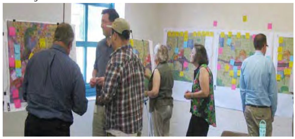
Gold Line Task Force meeting.

The Ford plant property moved significantly closer to being market ready in 2015. In 2013, the Planning Commission approved a master site plan for decommissioning, which guided final building and slab removals and seeding of 60% of the property. Staff from multiple City departments met monthly and worked in subgroups to oversee a jobs strategy study, an energy system study, and a stormwater management study. Eight large public meetings and multiple task