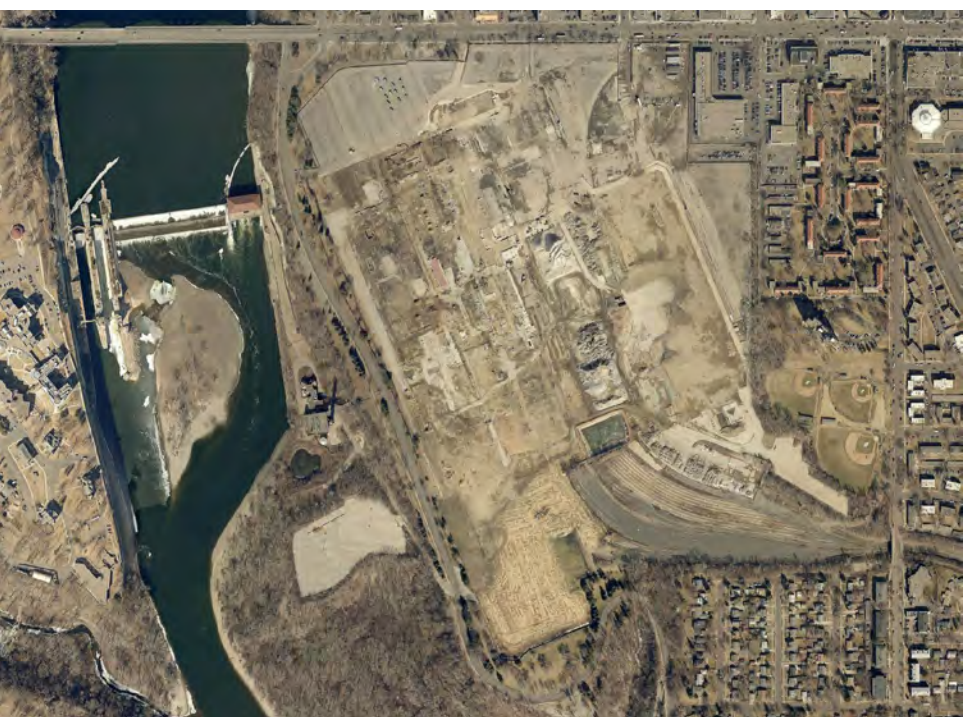
Ford site demolition 2015.

For more information: Department of Planning and Economic Development 1400 City Hall Annex 25 West Fourth Street Saint Paul, Minnesota 55102 Tel: 651.266.6573 http://www.stpaul.gov/ped