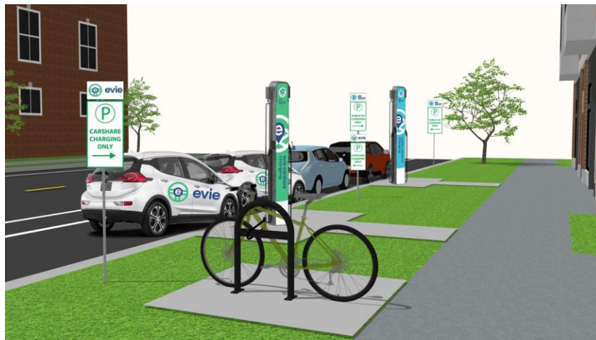
Most typical EV Spot configuration

The City of Saint Paul is implementing the EV Spot Network in partnership with the City of Minneapolis, HOURCAR, and Xcel Energy. This project will create a network of 70 electric vehicle charging hubs with electric vehicle carshare, where parking will be limited to electric carshare vehicles and electric vehicle charging only. One of these charging hubs is scheduled to be on a street near your location.