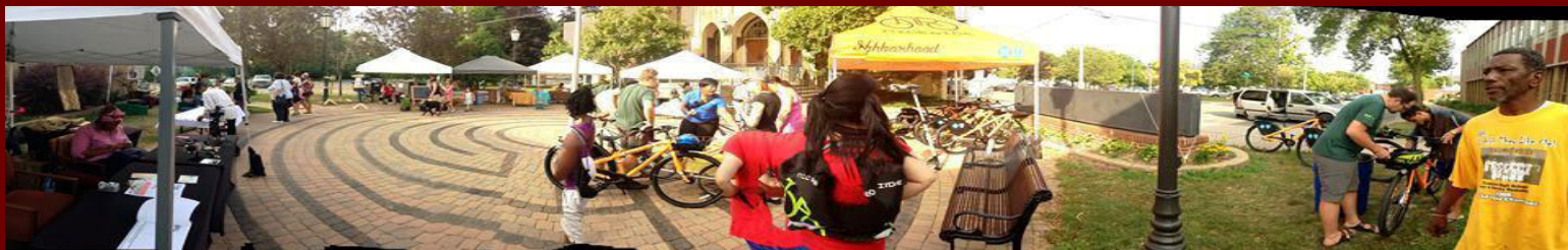
Dayton's Bluff farmer's market provides an opportunity for local residents to purchase locally, enjoy live entertainment and meet and mingle with their neighbors.