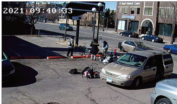
Listening/Freedom House individuals preventing entry to West 7th Parking Lot (former Dairy Queen)