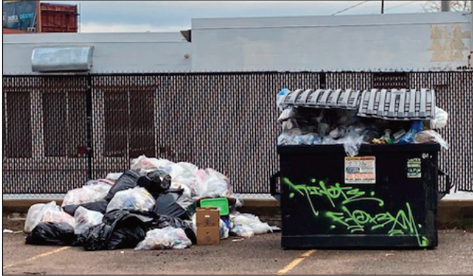
Garbage after a few days at the Listening/Freedom House, 296 West 7th Street

PLEASE NOTE -- some of the photos are very graphic and maybe disturbing to some readers