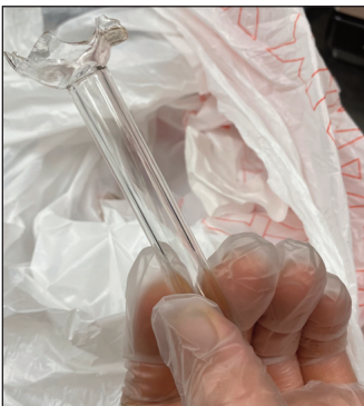
Probable crack pipe found near Tom Reid's Hockey City Pub on 3/23/21