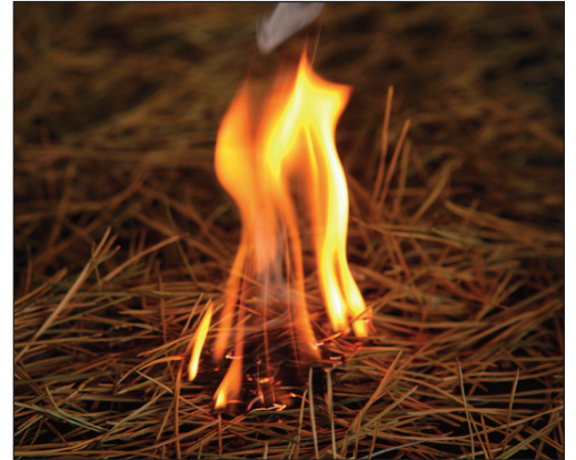
Two separate fires, 4/26/21 and 5/13/21 were set near the dry cleaners building at 286 West 7th by Listening/Freedom House individuals. The fires were caught early and extinguished 4/26 by Police and 5/13 by a Ramsey County Sheriff who saw flames as he was driving by