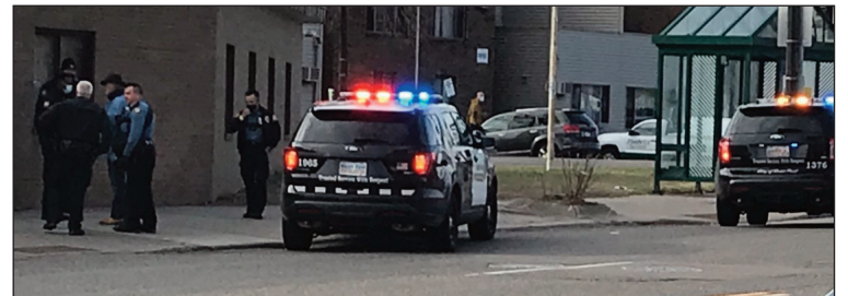
Saint Paul Police investigate shooting at Listening/Freedom House on 3/11/21 (above and right photos)