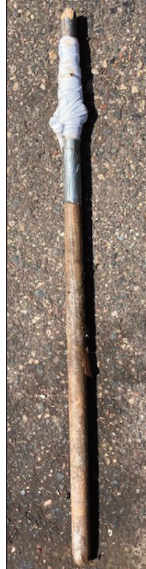
Weapon of cut-off rake handle with rocks tied into T-shirt fabric. Found in parking lot at 310 Sherman Street