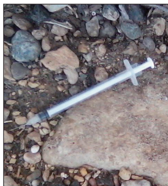
Syringe, one of 11 found on 5/9/21 in the parking lot at 310 Sherman Street and in the Alexander Ramsey House parking lot