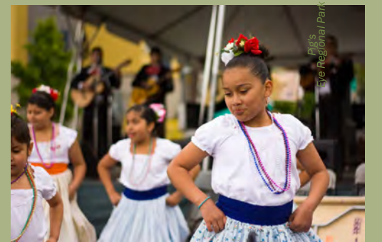
District del Sol