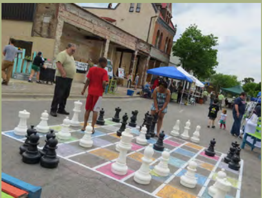
Near East Side