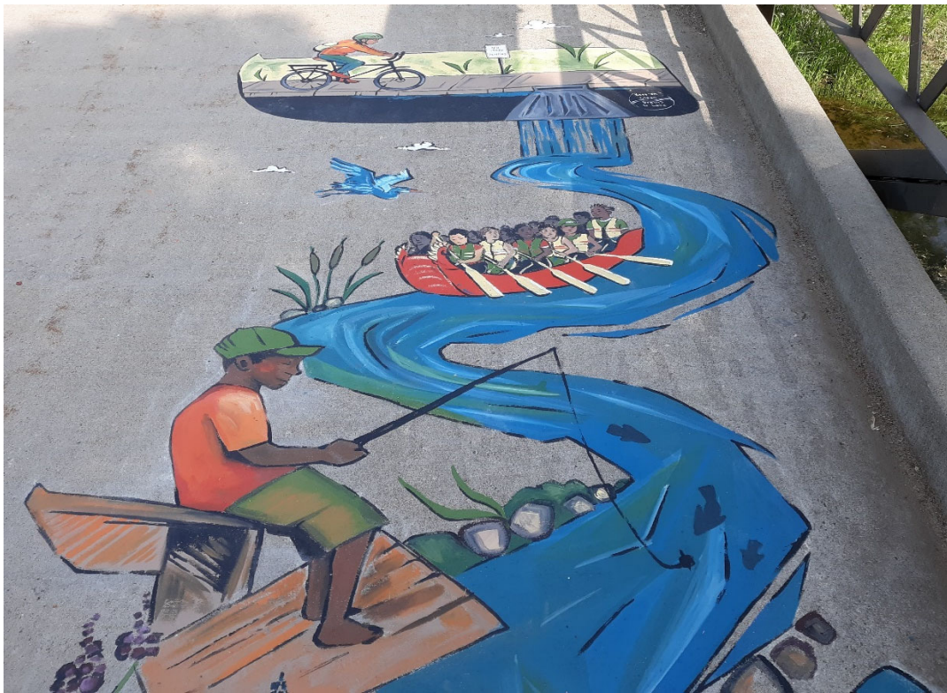
2019 Stormwater Mural at Phalen Lake