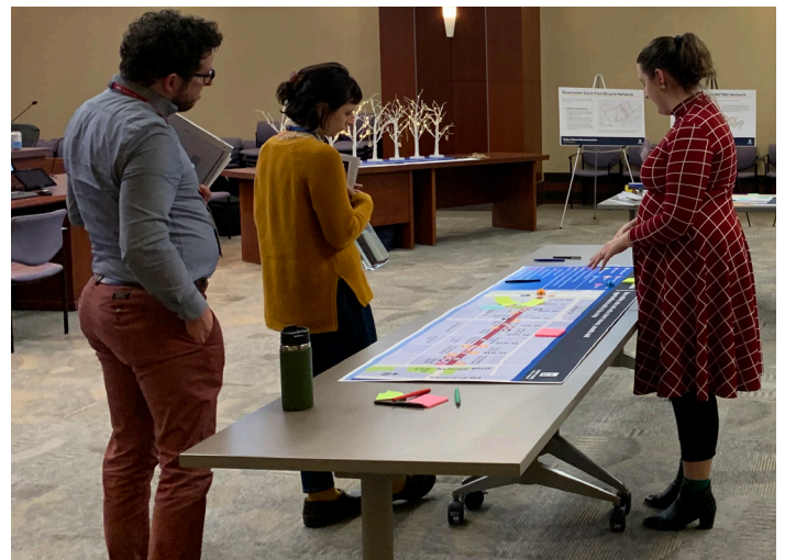
Open house at the Metropolitan Council