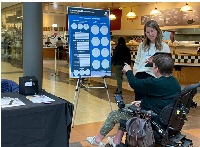
Pop-up event at Town Square

Corridor residents added to the Steering Committee