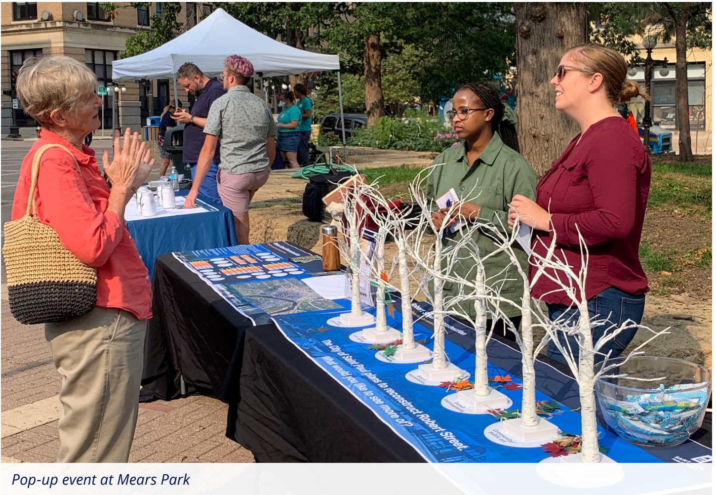
Pop-up event at Mears Park