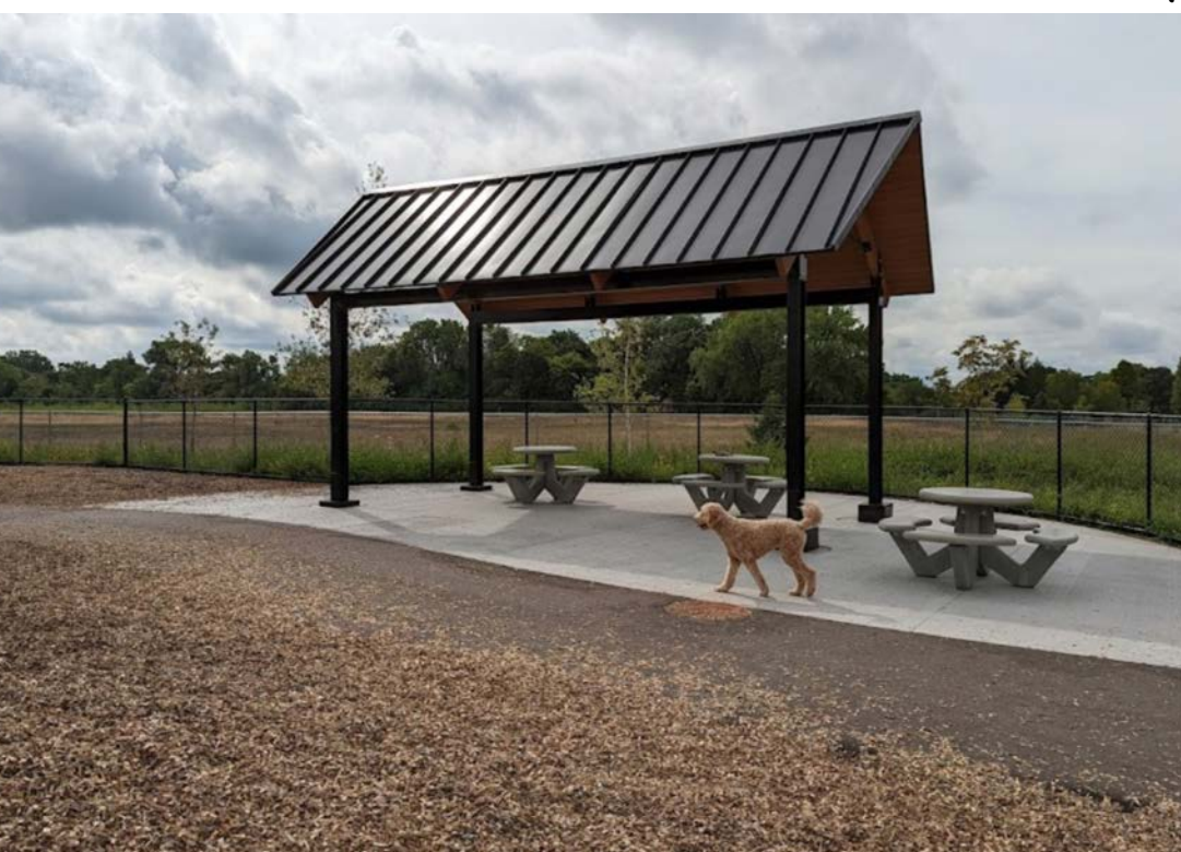
Covered Picnic Shelter