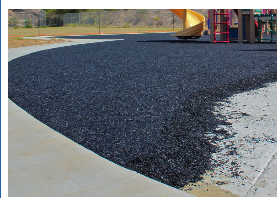
Replace Play Area Surface