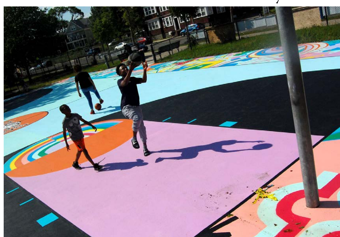
New Basketball Court