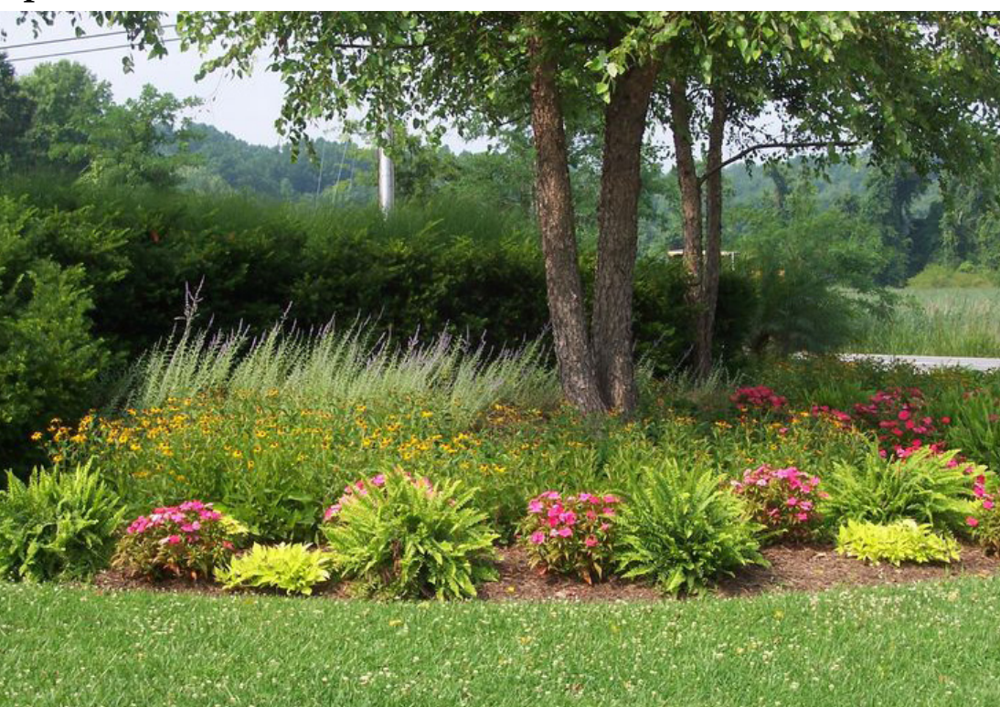
Replant Flower Beds