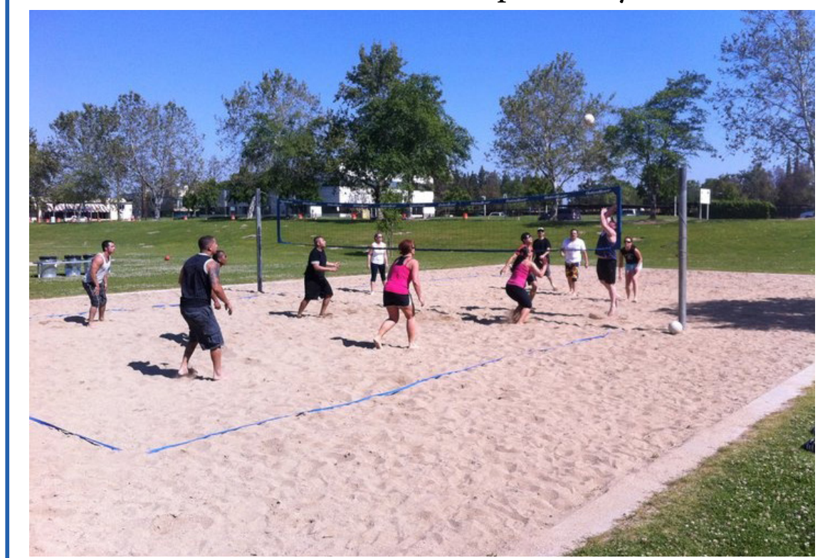
Sand Volleyball Court