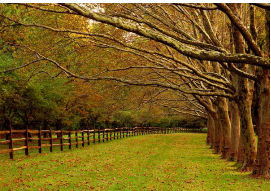
Improve Sight Lines