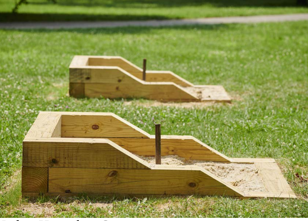
Update Horseshoe Courts