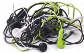
Cords and Holiday Lights

Clean and dry plastic bags and film can be dropped off at grocery or retail stores for recycling at no cost. Find locations at BagandFilmRecycling.org Use reusable bags when possible to reduce waste.