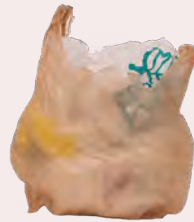
Plastic Bags Bubble Wrap Plastic Film