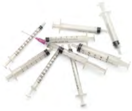
Sharps and Needles