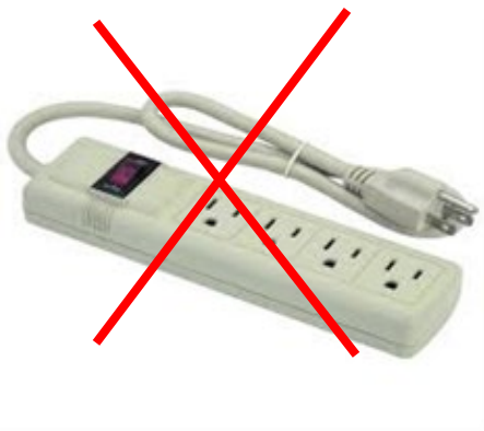
NOT A GROUND FAULT CIRCUIT INTERRUPTER