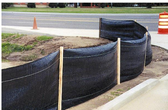
Properly installed silt fence