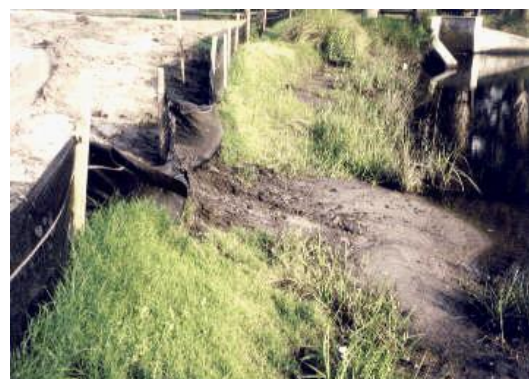
Silt fence that was not maintained