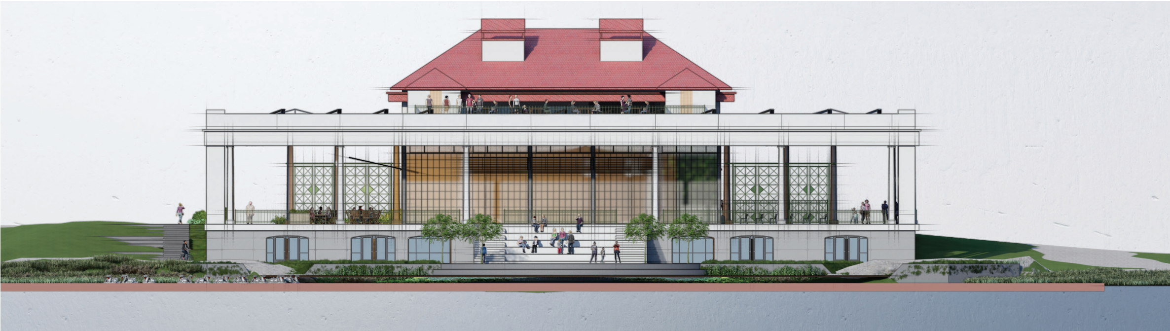
Conceptual elevation of the East side of the Como Lakeside Pavilion