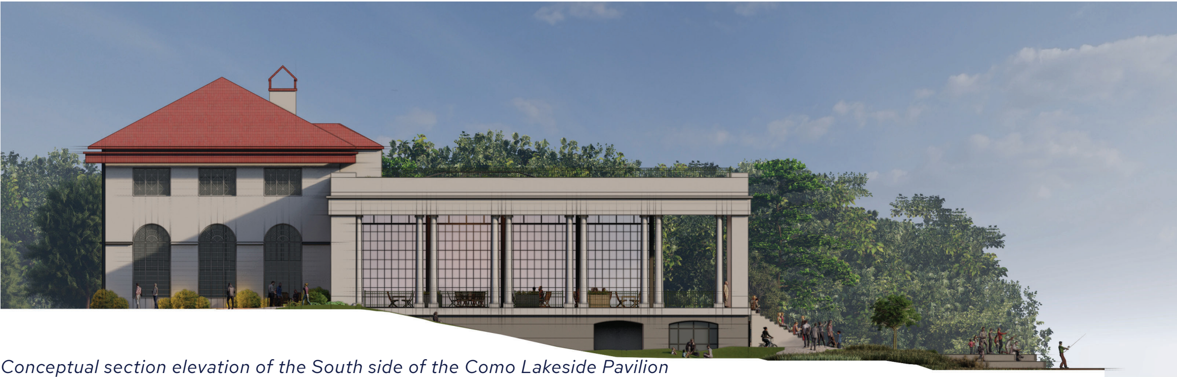
Conceptual section elevation of the South side of the Como Lakeside Pavilion