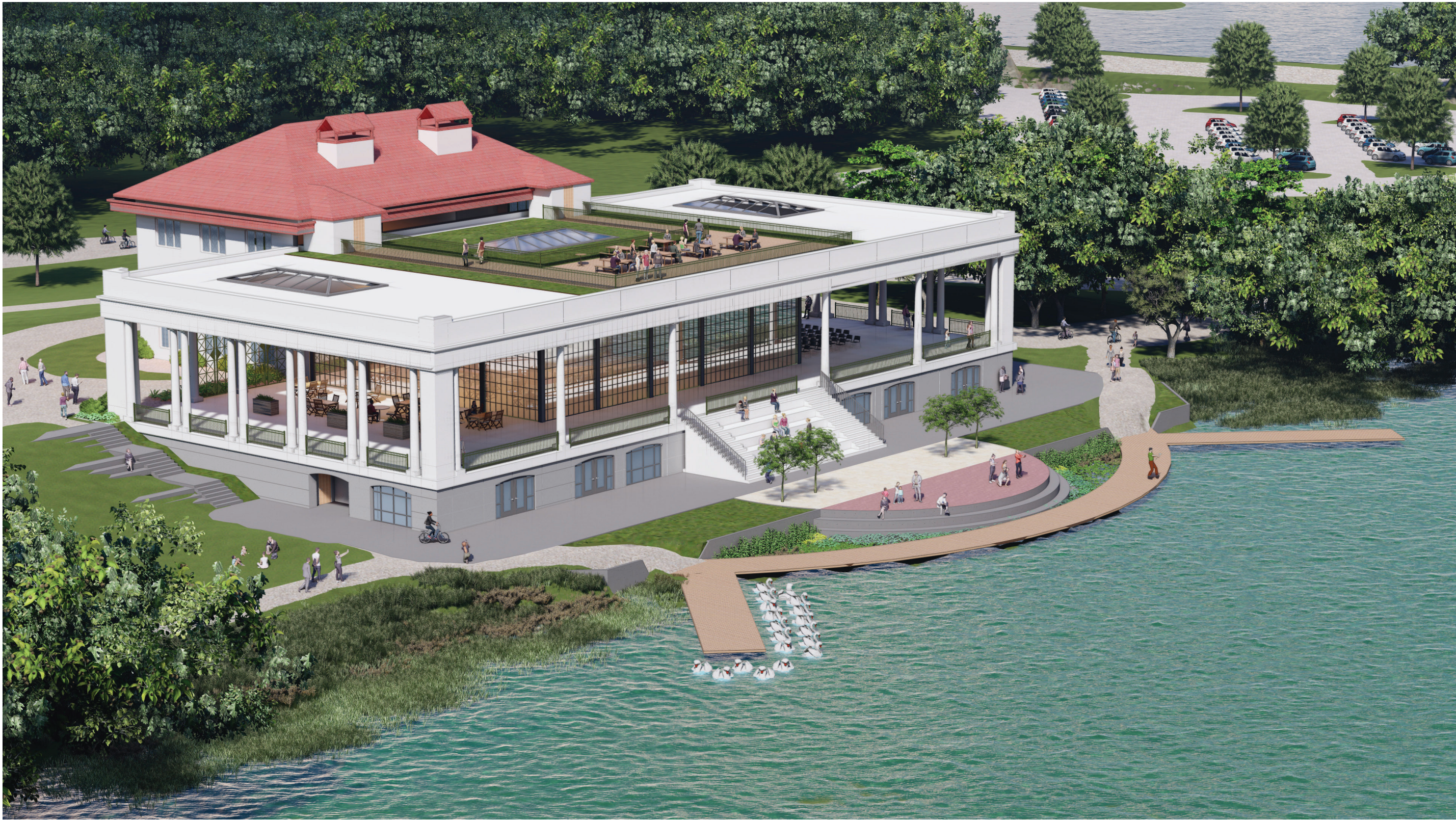
Conceptual rendering of the Renovated Como Lakeside Pavilion

Project Goal: Create a vision for the Como Lakeside Pavilion to upgrade the public facility to better accommodate public use and operations Next steps: Seek feedback, identify priority improvements, identify and apply for funding sources through inclusion in the Como Long Range Plan