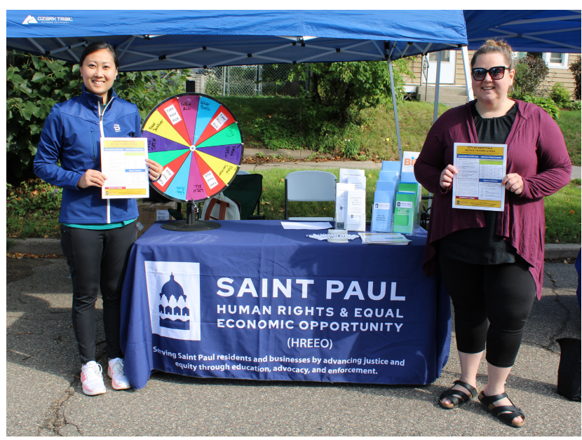
HREEO staff outreach at Selby Jazz Festival

As we navigate post-pandemic work environments, HREEO continues to work with employees to help them understand their rights in caring for their health and for their family's health. The Labor Standards team began offering free training for employers on requirements under the ESST ordinance to help with better compliance. The team created a notice poster that has now been translated into 5 additional languages to support employers in notifying their workers of their rights to accrue and use ESST.