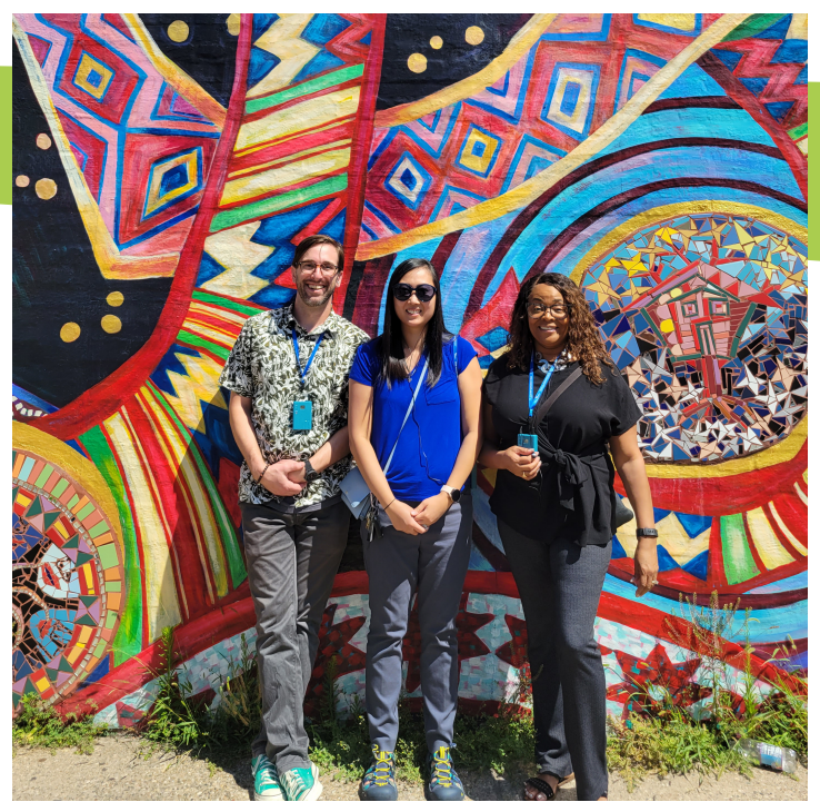
HREEO staff at Little Africa event.

The Department of Housing and Urban Development (HUD) Section 3 program requires that opportunities generated by HUD financial assistance be directed to low-income families and individuals. Section 3 also benefits businesses that employ and train local low-income residents. The city is committed to working with local vendors, community partners, and other local government agencies to ensure Section 3 continues to benefit local and low-income businesses and workers.