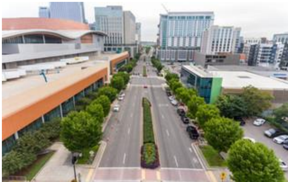
Image of Korean Veterans Boulevard in Nashville connecting east Nashville and I-24 to Downtown. Roadway includes a bicycle lane, parking and enhanced streetscape.