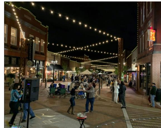
ACCESS LIMITS – Events/Fests