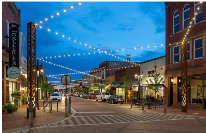
OPEN - Typical Day