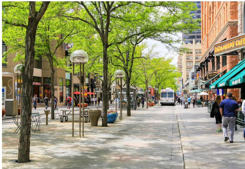
Denver 16 th Street