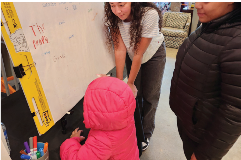
825 Arts Art-BQ pop up (above).