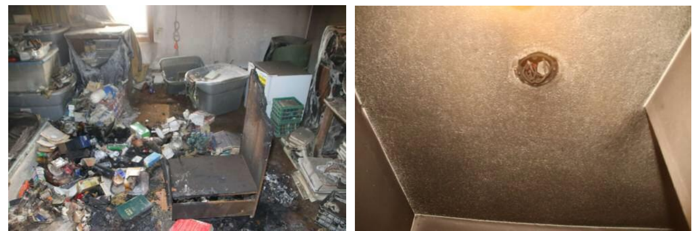
This rather small fire consumed most of the oxygen in the apartment and enough toxic smoke to kill the resident. The hardwired smoke alarm on the right had been disabled.

FATAL APARTMENT FIRE – Saint Paul Firefighters were called to the 300 block of Cottage Avenue West on March 3<sup>rd</sup> at 12:27 pm for a report of smoke in an apartment. Firefighters arrived to find a small fire that had extinguished itself due to lack of oxygen. There was smoke and heat damage throughout the apartment. The woman who lived there was found dead on the floor. The fire started by a candle left unattended while she fell asleep. It is believed she woke up after smoke filled the apartment and was only able to take a few steps before being overcome by the toxic smoke. There were no working smoke alarms in the apartment but at least one smoke alarm that had been disabled. Damages are estimated at $78,566. Smoke alarms save lives – make sure you test yours monthly, replace batteries annually (unless you have a 10 year battery) and replace the entire alarm every 10 years. Also, always blow out candles when you leave the room or to go sleep. This is Saint Paul's first fire fatality of the year.