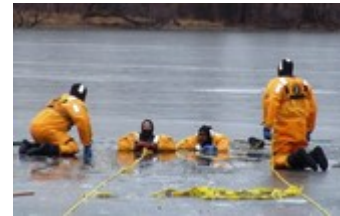
Firefighter/EMT at a Water Rescue Training at Lake Phalen.

We prepare all of our Firefighter/EMTs for any and all medical emergencies and critical situations.