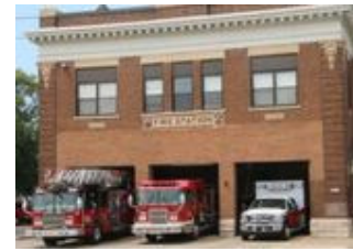
Fire Station 18

Saint Paul Fire Department invites you to join us at our