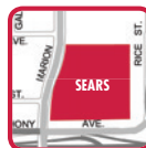
SEARS LOT $20