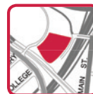
MN HISTORY CENTER $20