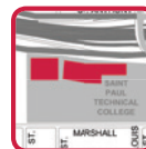
ST. PAUL COLLEGE $20