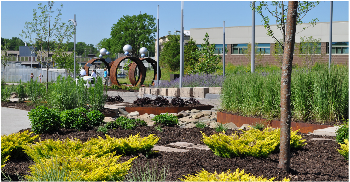
BUILT PROJECT RAIN GARDEN