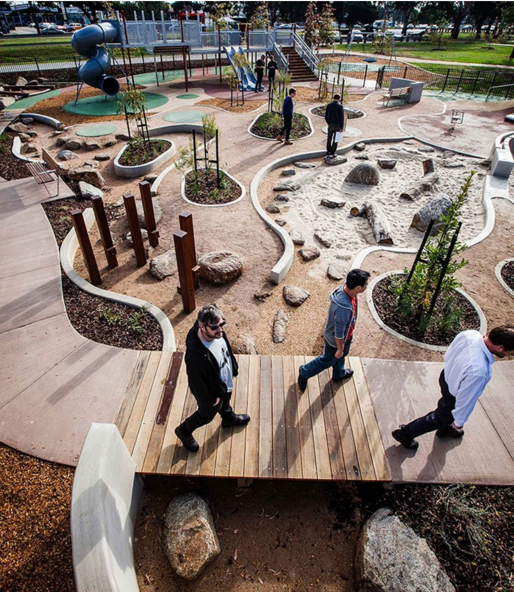
PLAY AREA WITH BRIDGE