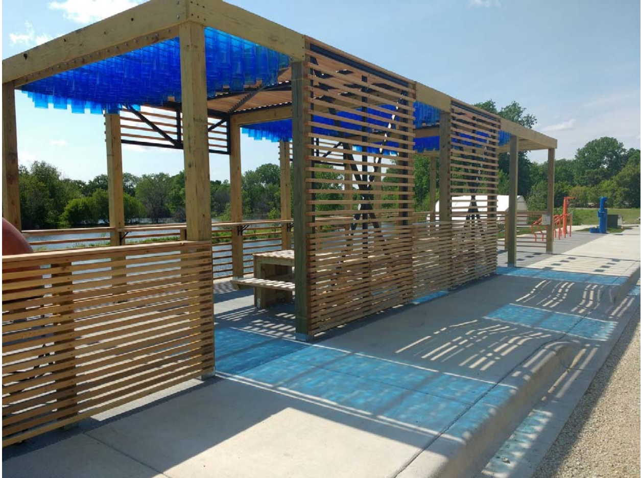
Lyndale Gardens Public Pavilion