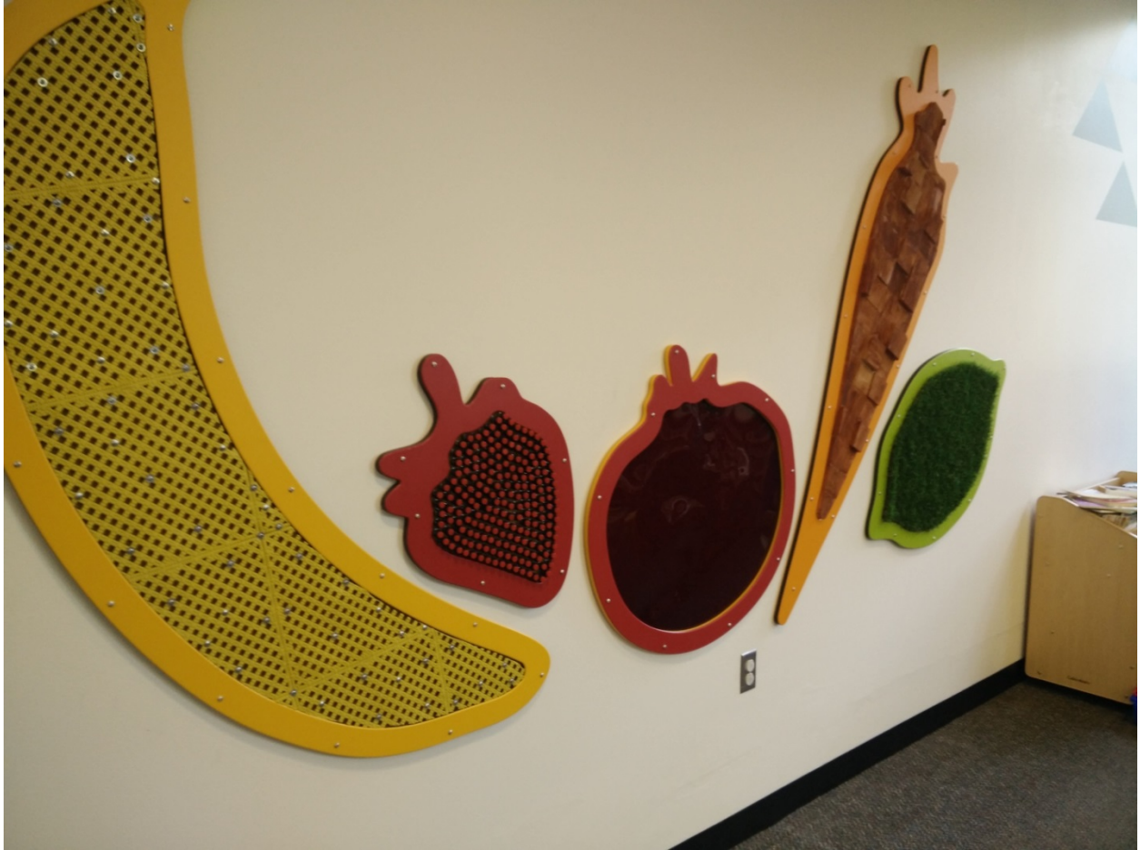
2015 Sensory Panels HDPE, Acrylic, Cedar, Buttons, Artificial grass