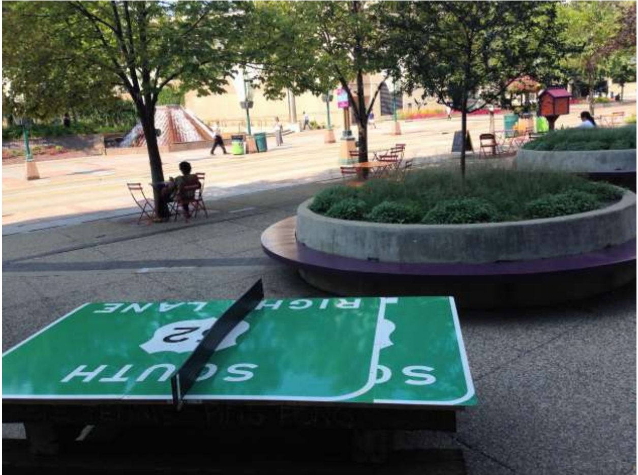
2009 Ping Pong 9' x 5' Recycled freeway sign, salvaged railroad ties, machined HDPE