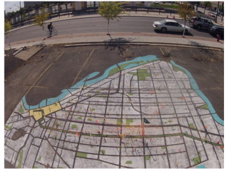
Mapping the Ave.