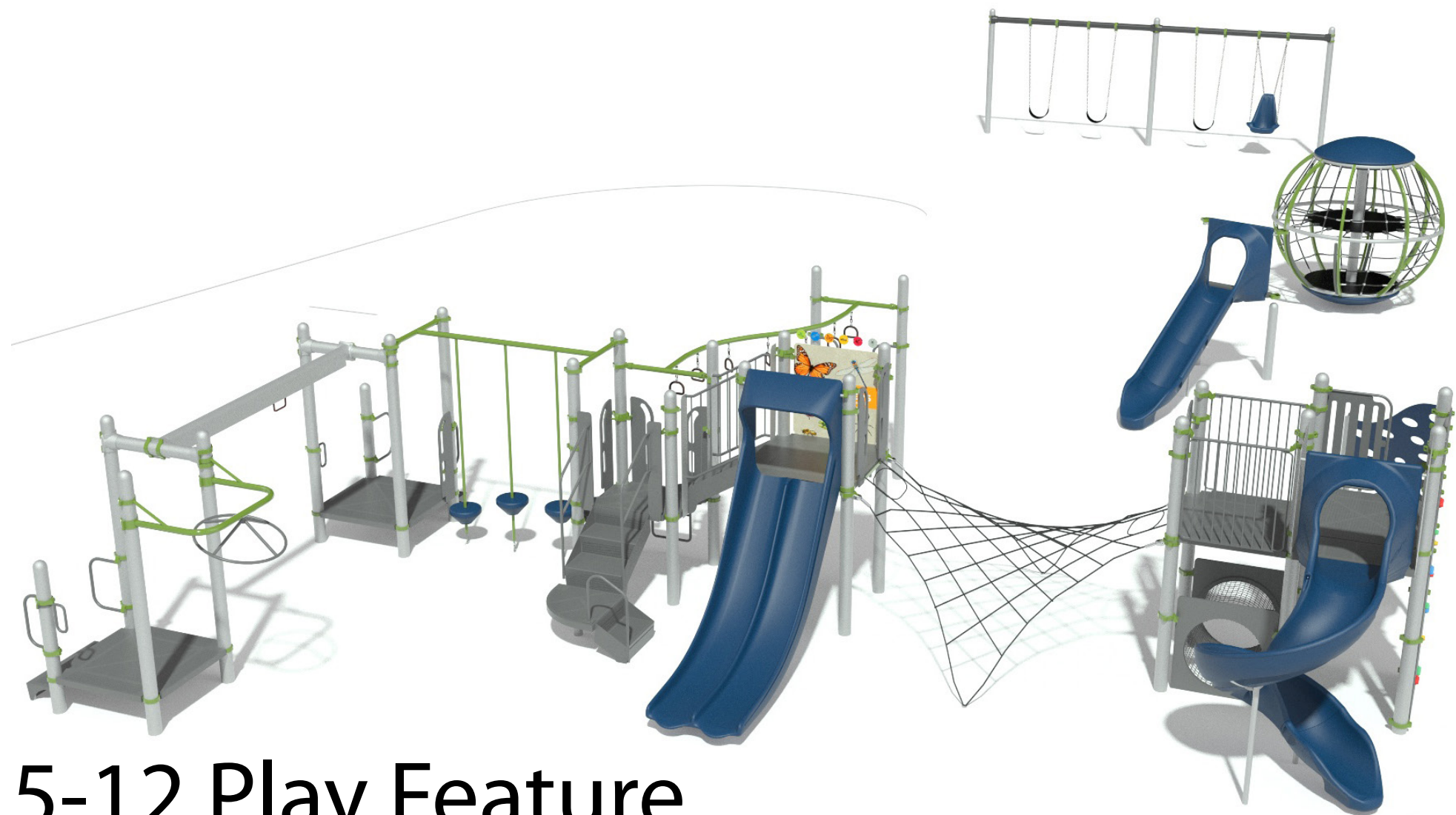
5-12 Play Feature