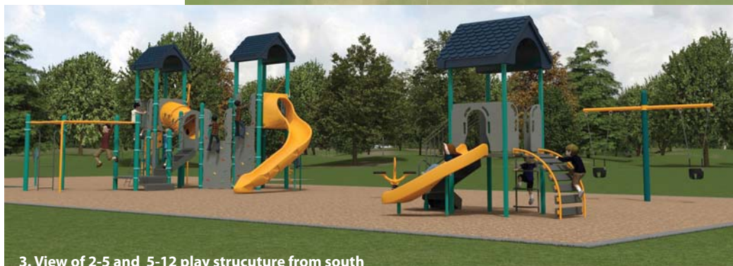
3. View of 2-5 and 5-12 play structure from south