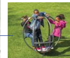
Comet II - group spinning element