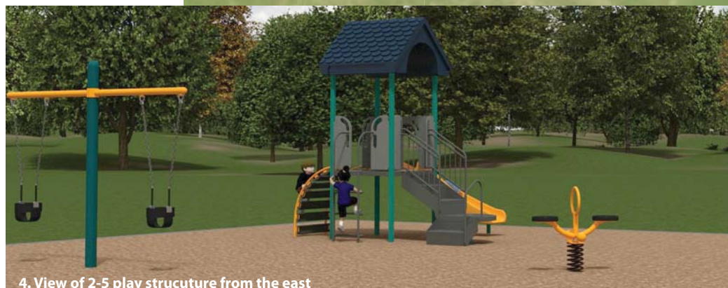
4. View of 2-5 play structure from the east