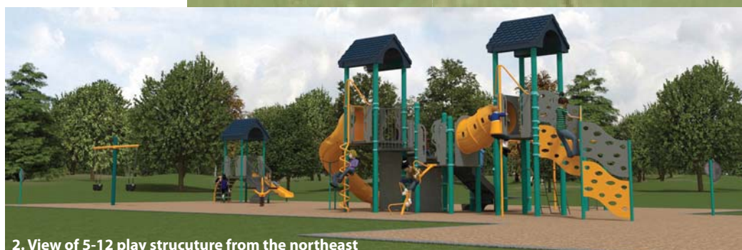
2. View of 5-12 play structure from the northeast