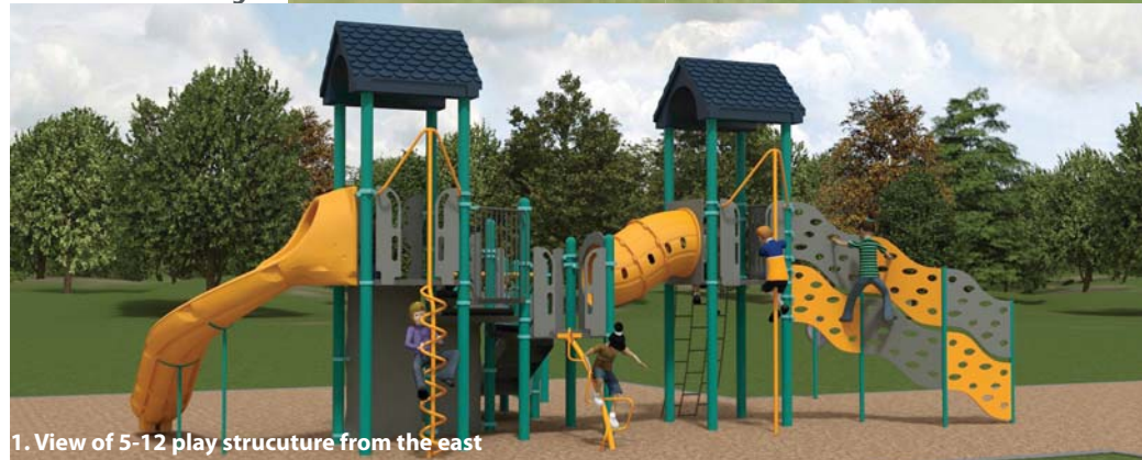
1. View of 5-12 play structure from the east