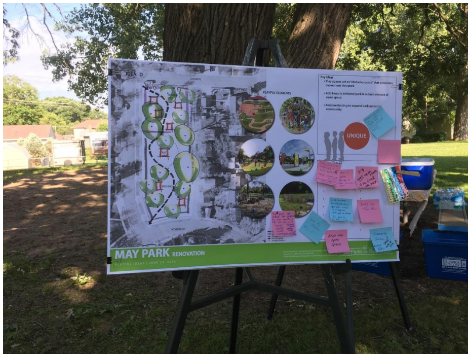
Board 8: Public Art Comment