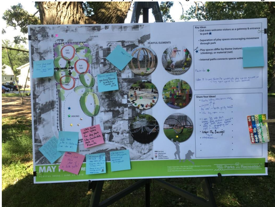
Board 6: Idea C Comments