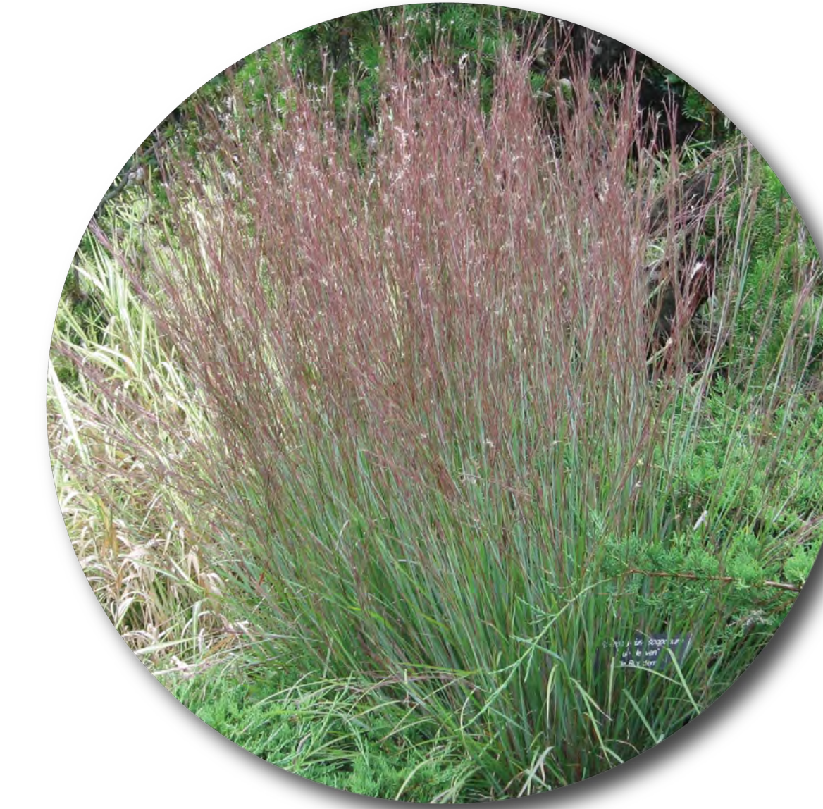
'blue' little blue stem