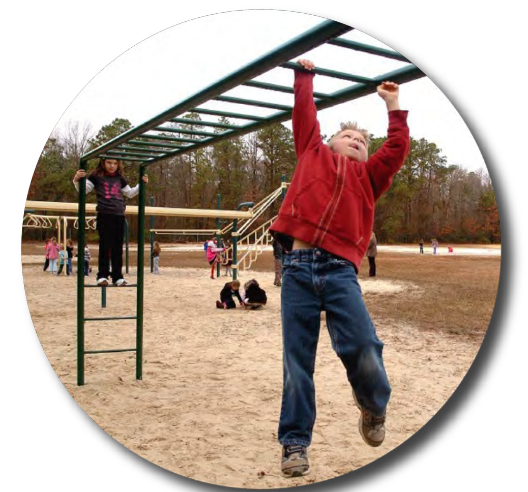
traditional monkey bar