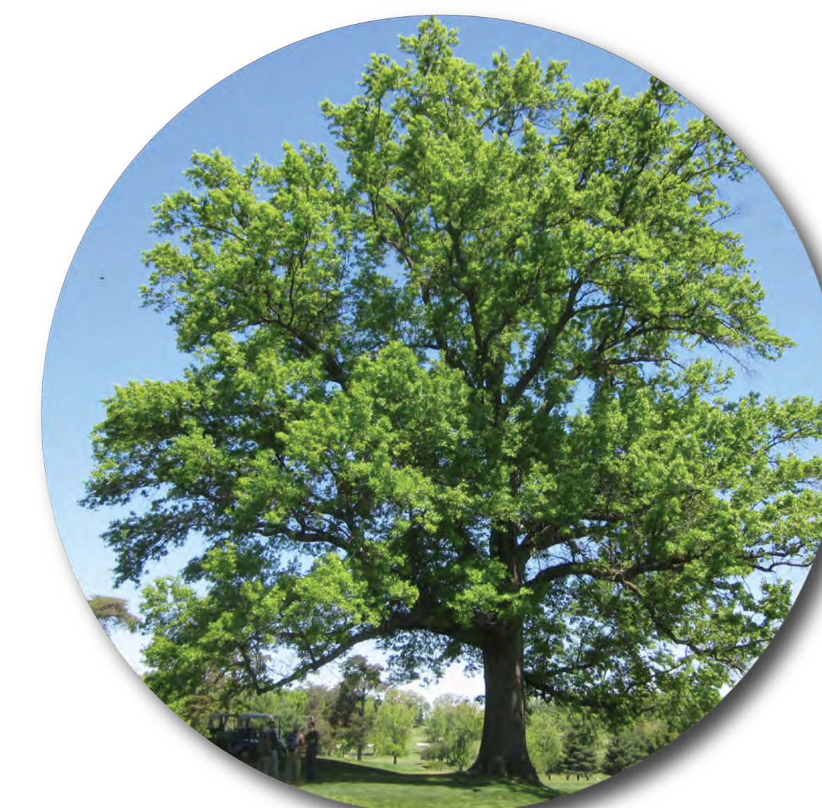
northern pin oak