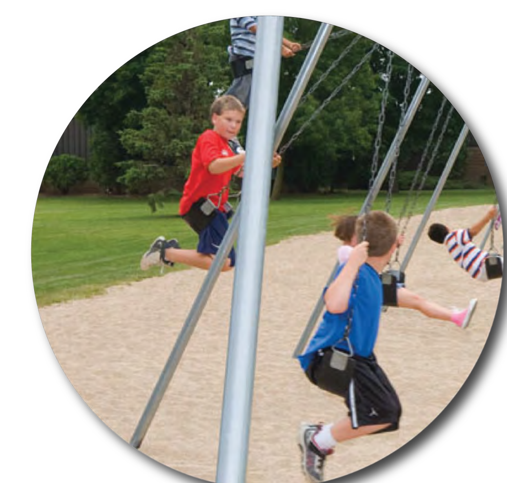
traditional swing set

Which swing element do you prefer? (Place your dot on one)