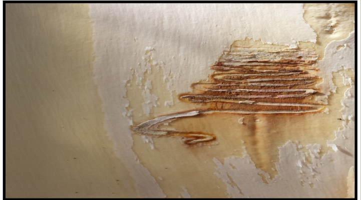
Top: A close-up of an adult Emerald Ash Borer.