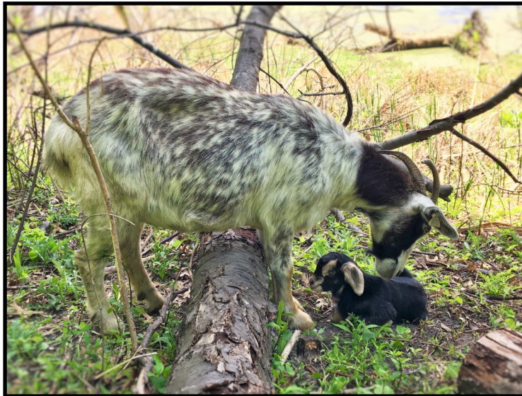
Flare nurtures her twins, Bean and Barnie, as they explore Indian Mounds Regional Park

Keep an eye out this summer for our furry friends as they roam the beautiful oak woodland overlooking the winding Mississippi River and downtown Saint Paul.