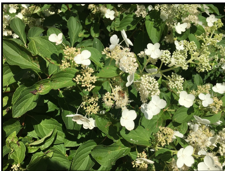
Dwarf honeysuckle (pictured above) and panicle hydrangeas will be added to the entrance of Trout Brook Nature Sanctuary

The City of Saint Paul's Gardening Program has been busy increasing its presence by installing new perennial beds and revitalizing old ones throughout the city. This year, with the aid of a grant generously awarded by the Saint Paul Garden Club (SPGC), we will utilize the funding to add four new pocket gardens on Saint Paul's East Side. This year's mission will be to increase