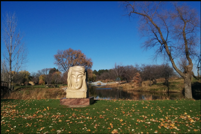
Meditation sculpture by Master Lei Yixin.