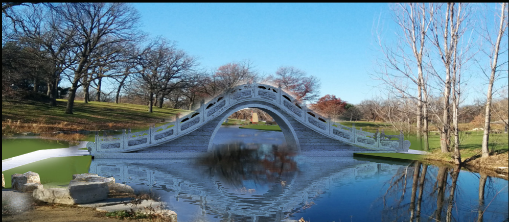
The arch bridge frames views to Meditation sculpture.

The China Garden at Phalen Regional Park will be a living symbol of the peace and friendship that exists between Saint Paul and its sister city Changsha, China. The garden will honor the Hmong ancestral home to Changsha, China and integrate Chinese garden design principles within the natural setting of Phalen Regional Park. A strong visual connection to the Meditation sculpture by Master Lei was critical to the development of the garden plan. Several interconnected loop trails allow visitors to experience the garden from a number of vantage points.