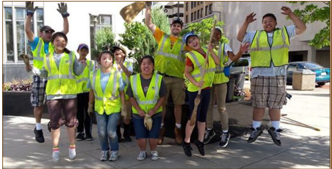
The Blooming Saint Paul Right Track Team jumps for joy, enjoying the fruits of their labor. Right Track works with youth to beautify the City of Saint Paul.

youth of Blooming St. Paul Right Track had biweekly education sessions on horticulture. In these sessions, the youth learned about plant anatomy, general ecology, strategies to maintain gardens, and the varieties of plants native to Minnesota (especially