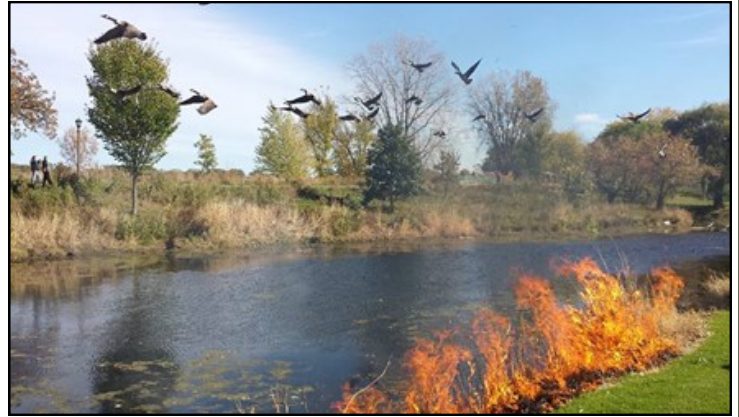
Geese fly off as a prescribed burn gets too close for comfort at Phalen Regional Park.

Get outside, visit a park and share the natural beauty of Saint Paul! Saint Paul Natural Resources will be running two seasonal photo contests each year to showcase natural spaces in our parks. Photos taken and submitted within each contest period will be posted on Saint Paul Natural Resources' Facebook page for public voting.