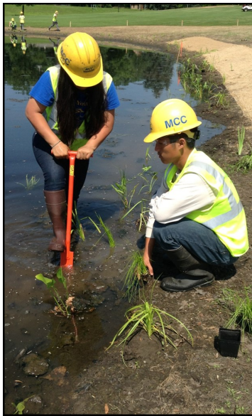
Installation of native plants around a Phalen golf course pond.

Environmental Services has recently received several grants to fund projects in Saint Paul Parks. Included is a Conservation Partners Legacy grant for $143,475 to restore 60 acres of oak woodland and oak savanna at Indian Mounds Regional Park. Grant money will also help fund prescribed burning, a valuable management tool for these plant communities.