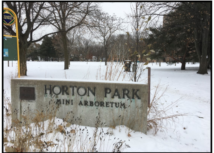
Even in winter, Horton Park's mini-arboretum of trees offer interesting variety for a brisk walk!

A brisk walk through the park will provide a glimpse of mature coniferous trees such as white pine and Douglas fir; deciduous shade trees such as bicolor oak and Kentucky coffeetree; and ornamental and fruit trees such as Northstar cherry and Snowbird hawthorne.