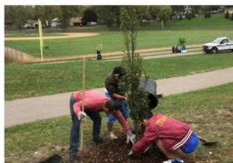
Guadalupe Alternative Programs helping Forestry with a tree planting