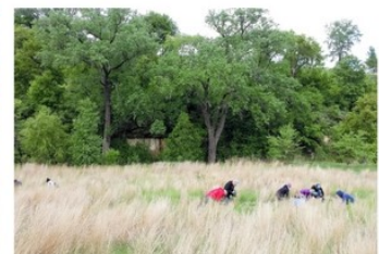
Our piloted Bruce Vento EcoStewards program. More to come in 2018!