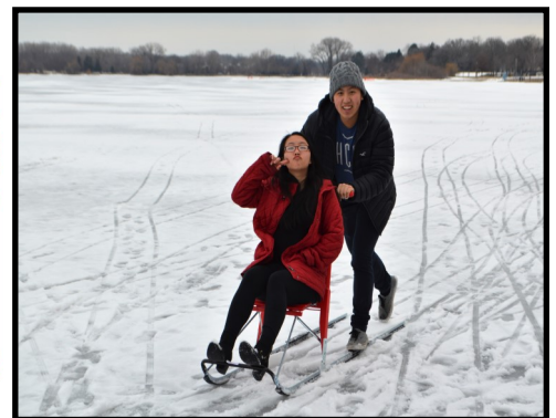
These programs are funded in full or in part by the Clean Water, Land and Legacy Amendment and REI.