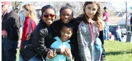
Kids helping keep the city clean at the Annual Citywide Spring Cleanup