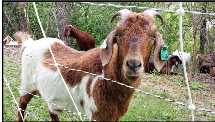
Goats proved an invaluable tool for combatting invasive species like buckthorn in hilly and natural areas.

2018 Preview Indian Mounds Regional Park – Goats will return in