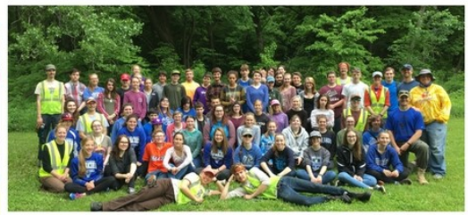
Thanks to the groups and individuals who volunteered their time this year! We saw over 4,500 hours of volunteer service.