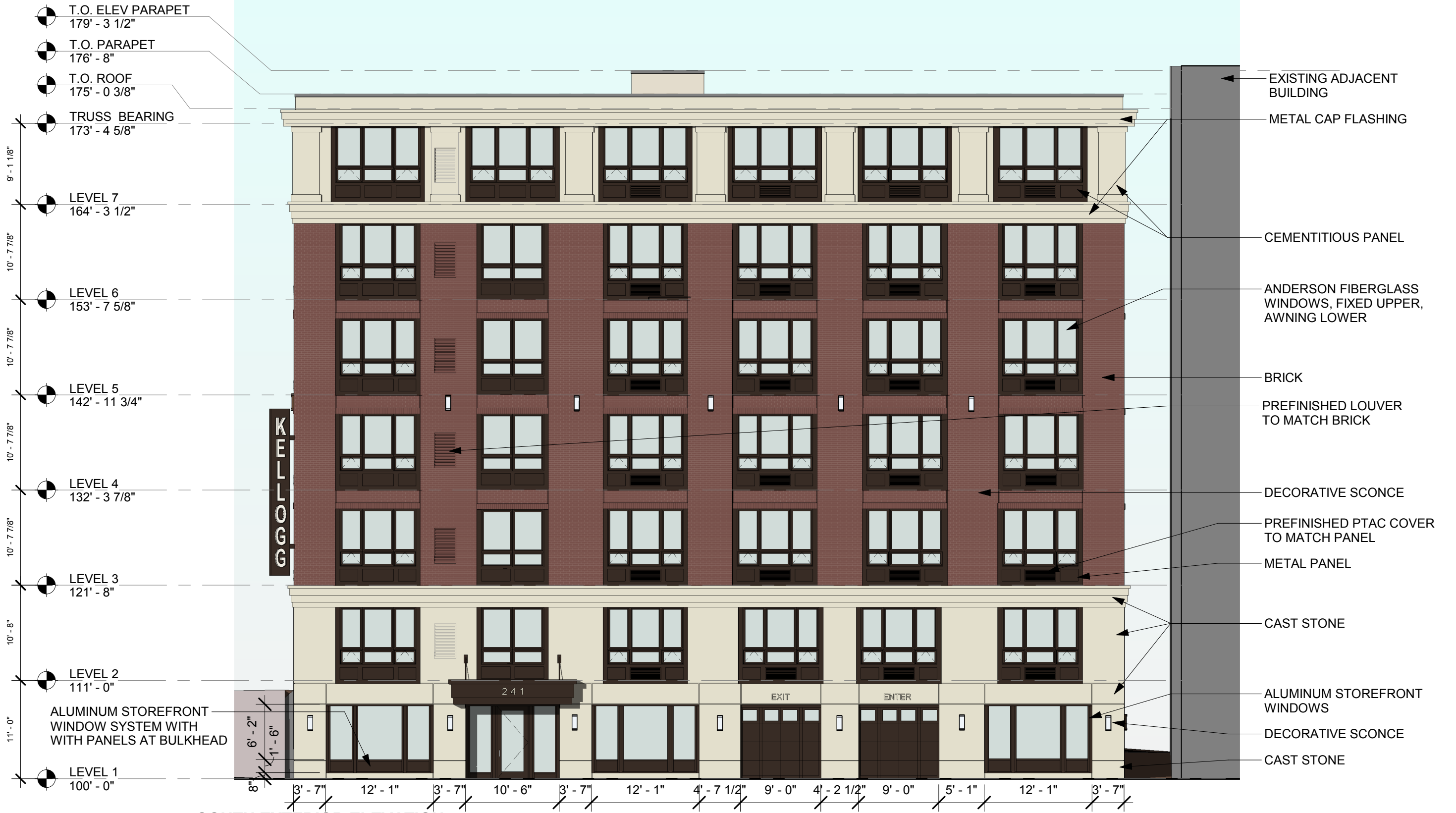
SOUTH EXTERIOR ELEVATION 3/32" = 1'-0"