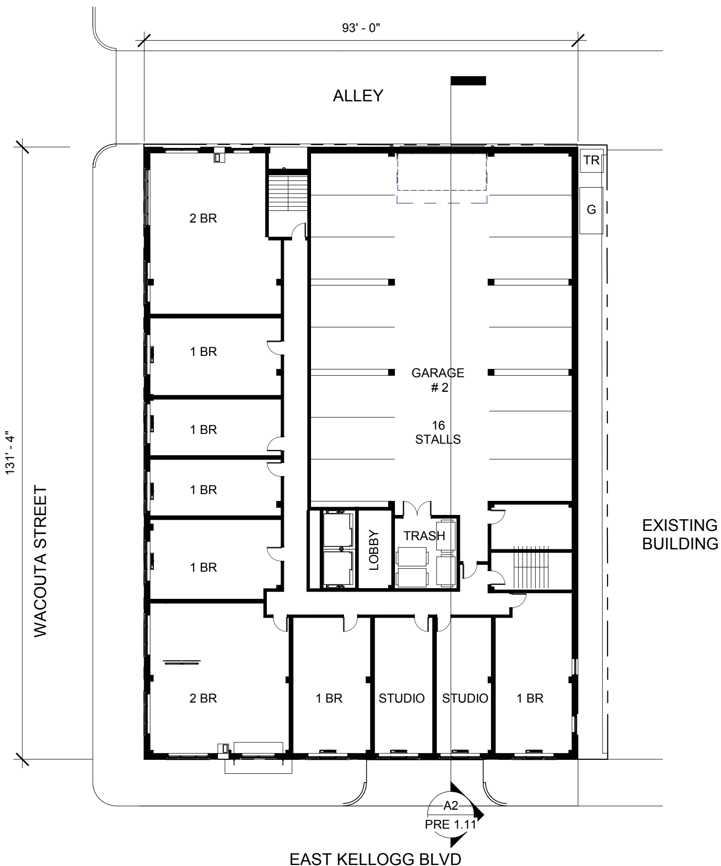
2 SITE PLAN / FLOOR PLAN - LEVEL 2 1" = 20'-0"