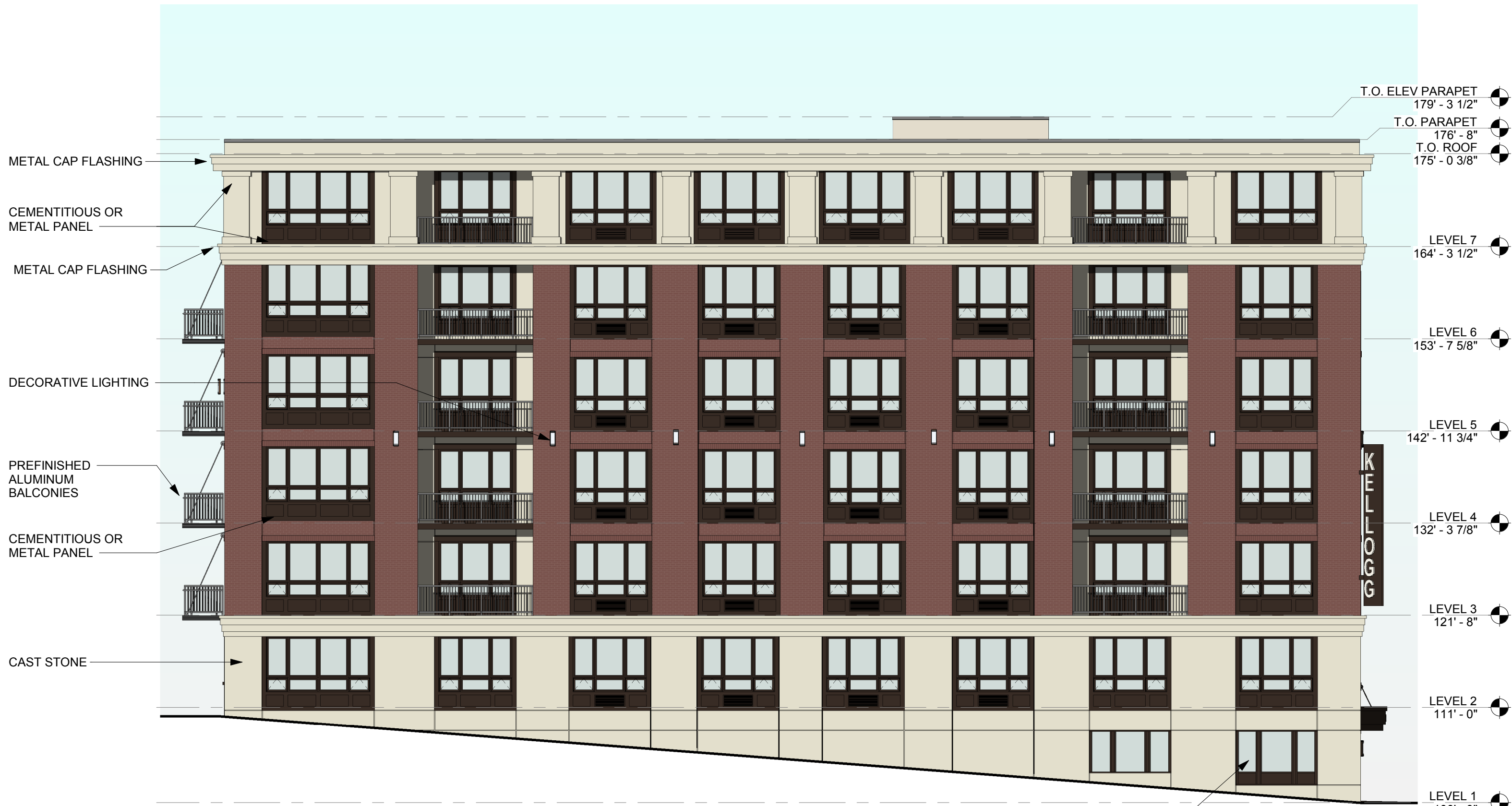
WEST EXTERIOR ELEVATION 3/32" = 1'-0"