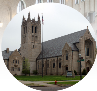
House of Hope Presbyterian Church 797 Summit Avenue