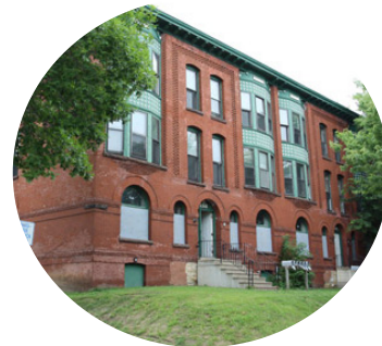
Euclid View Flats NHRP Nomination