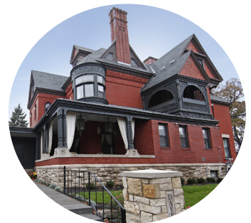
Frank and Anna Shepard House