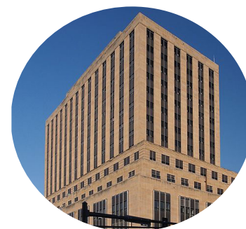
United States Post Office and Custom House NHRP Nomination