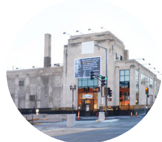
Minnesota Milk Company Building NHRP Nomination