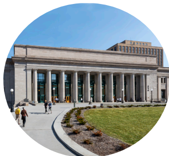
Union Depot 214 East Fourth Street