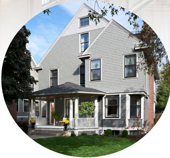
Francis M. Finch House 839 Osceola Avenue