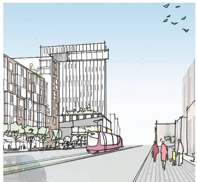
Speculative rendering of the Midway Redevelopment District