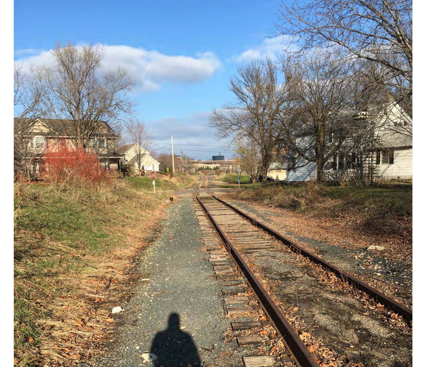
Ford Spur at Watson