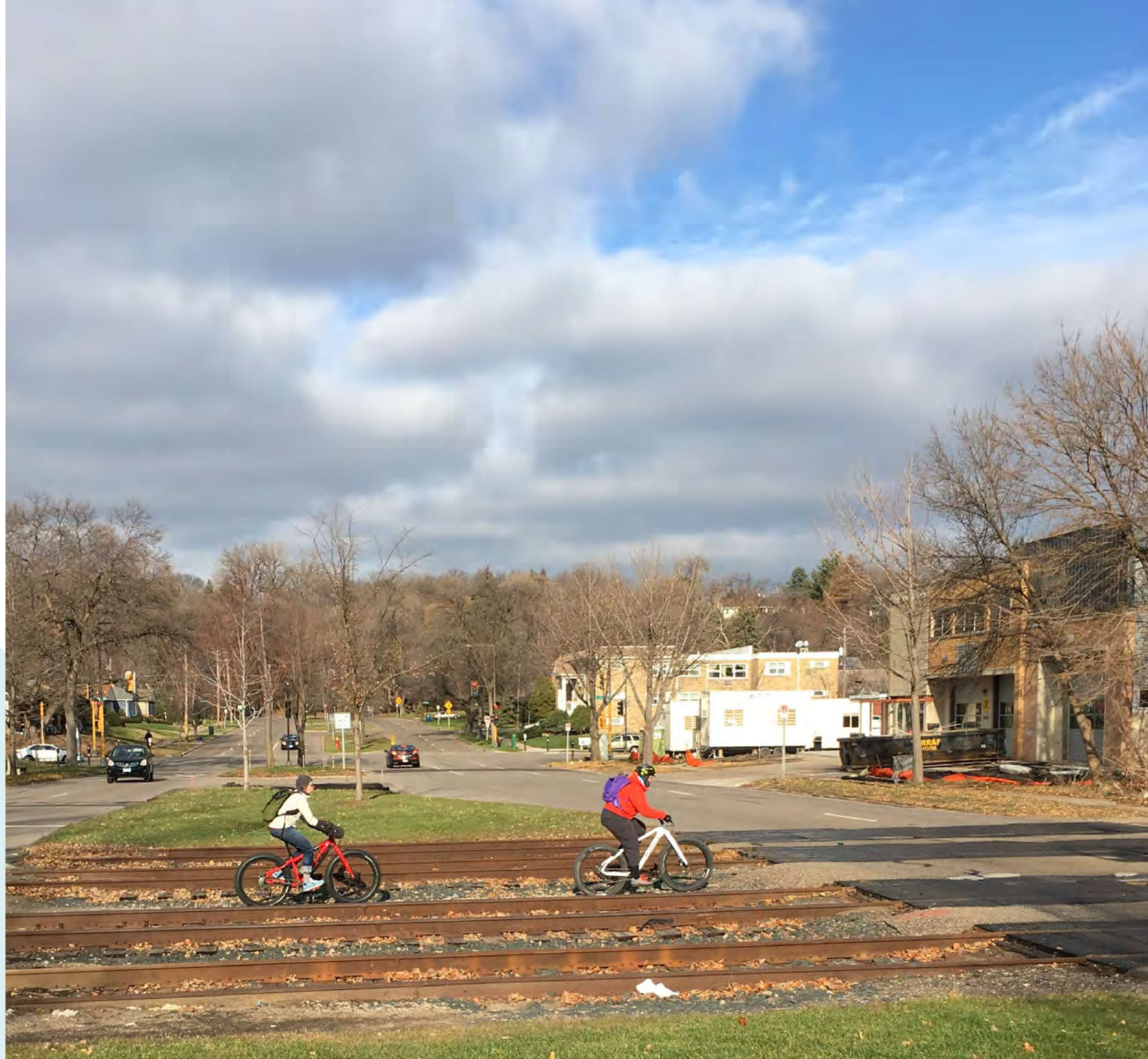
Ford Spur at Edgumbe