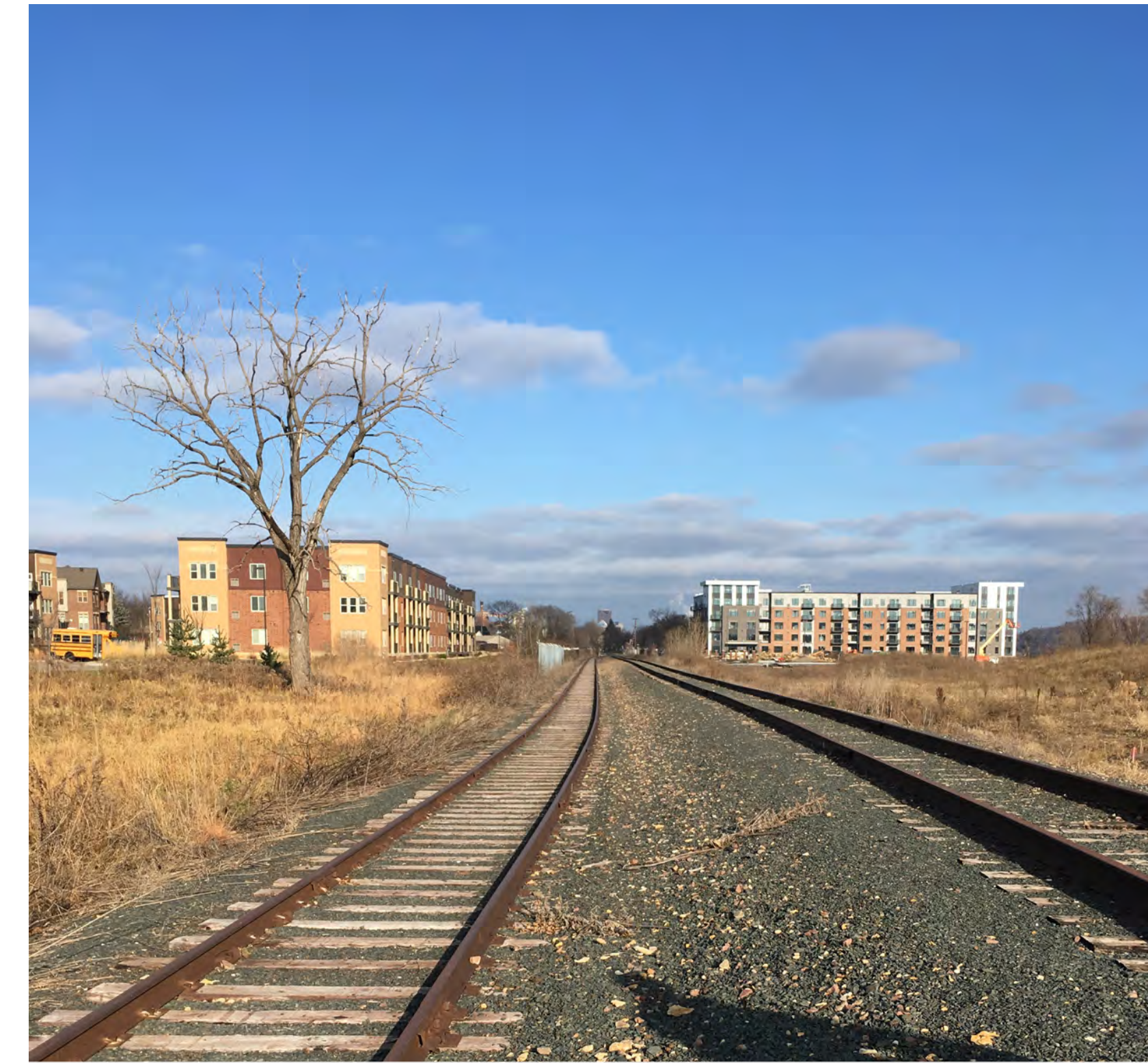
Ford Spur at Victoria Park