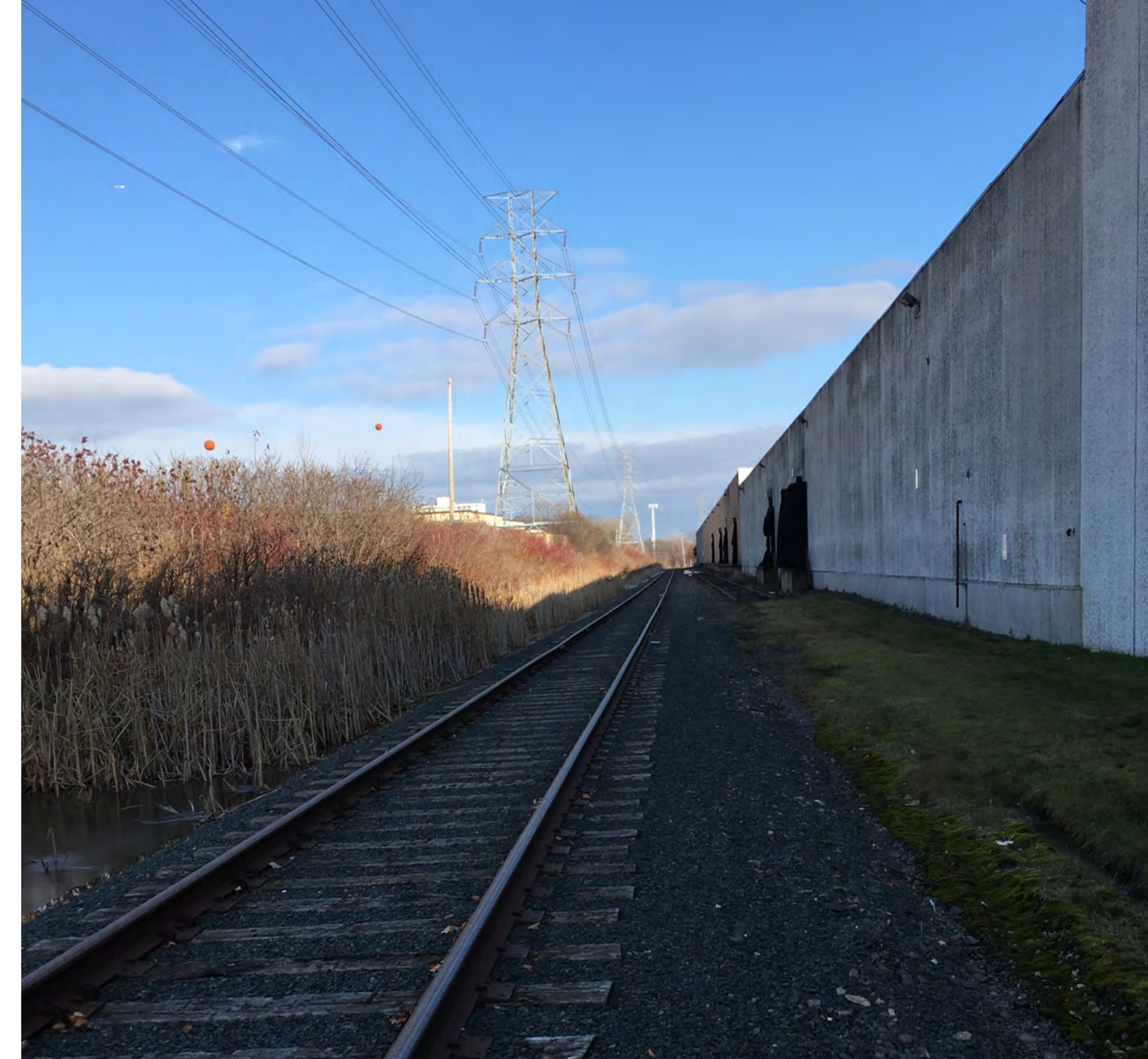
Ford Spur at Homer