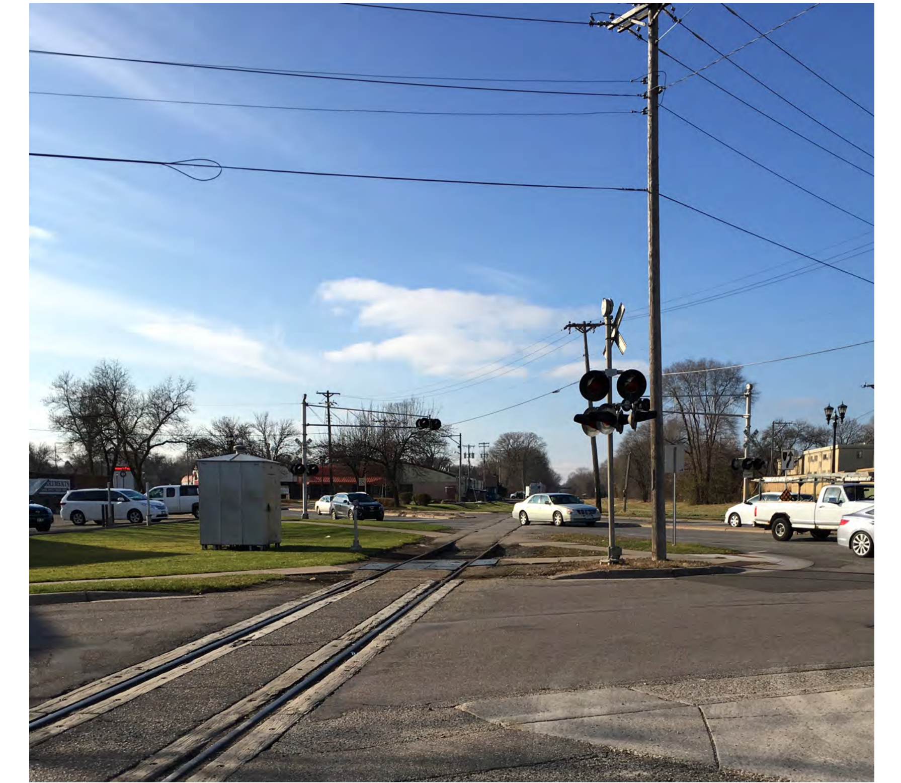
Ford Spur at West 7th