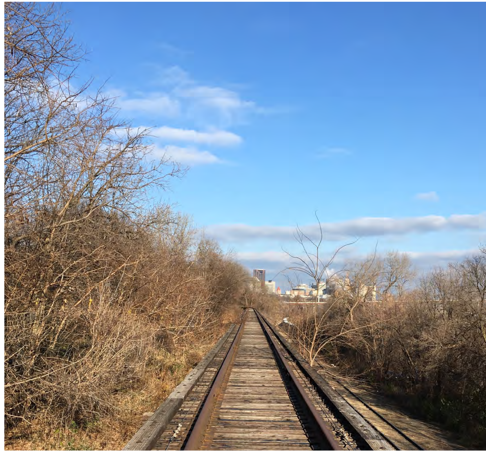
Ford Spur Trestle near Colburne