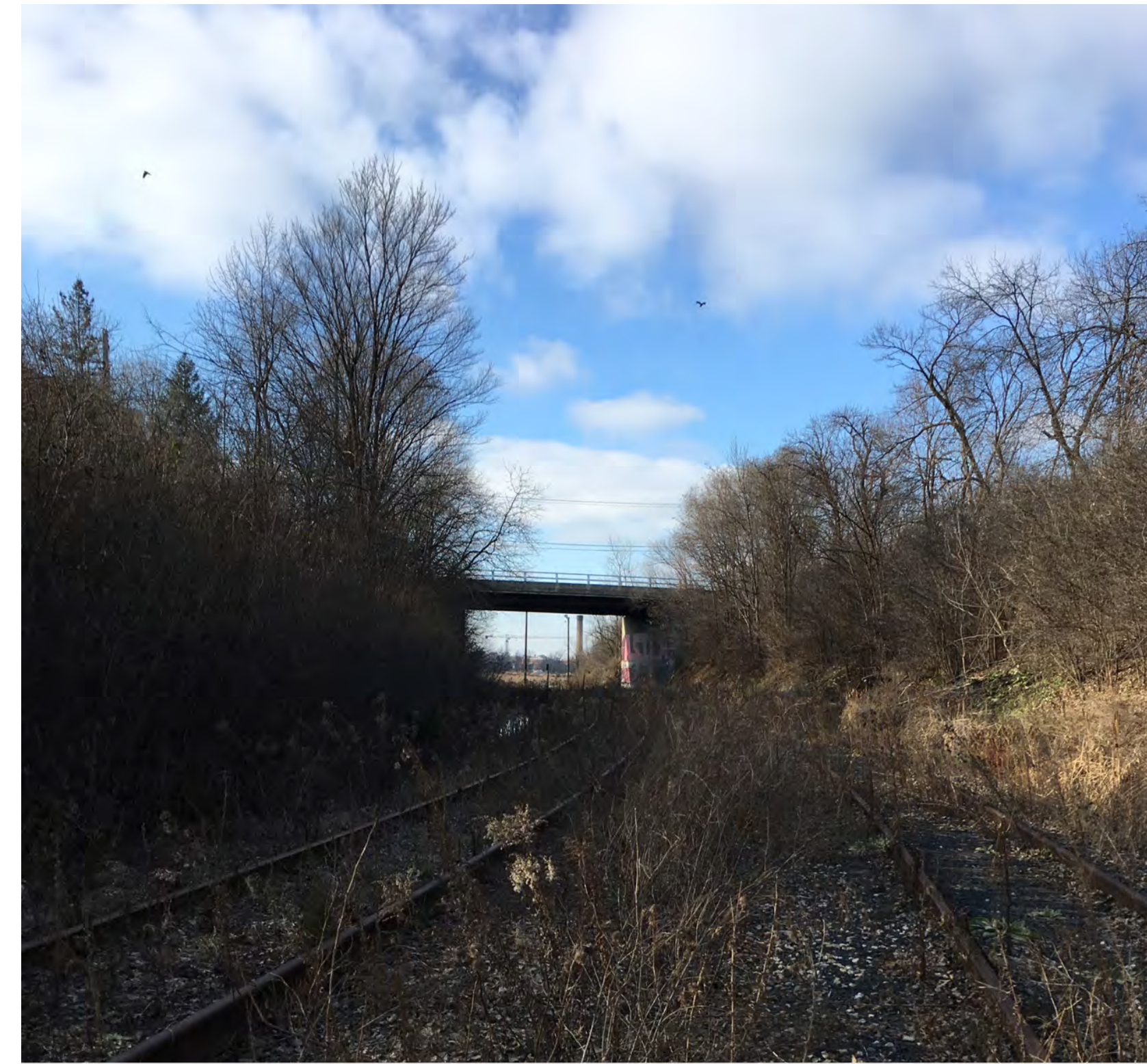
Ford Spur over Elway