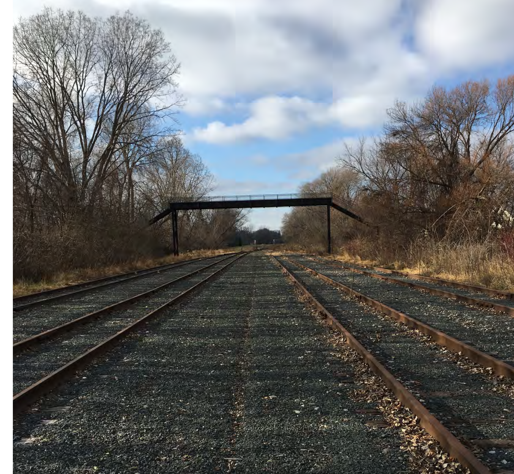
Ford Spur near Homecroft