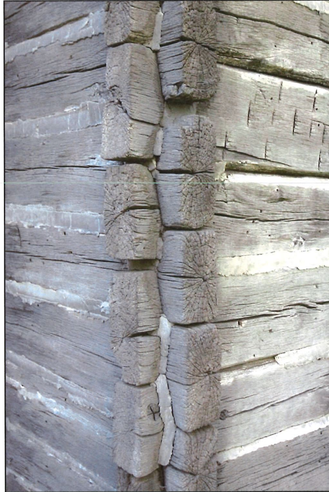
Photograph 5: Detail of log notching at northwest corner, looking southeast.