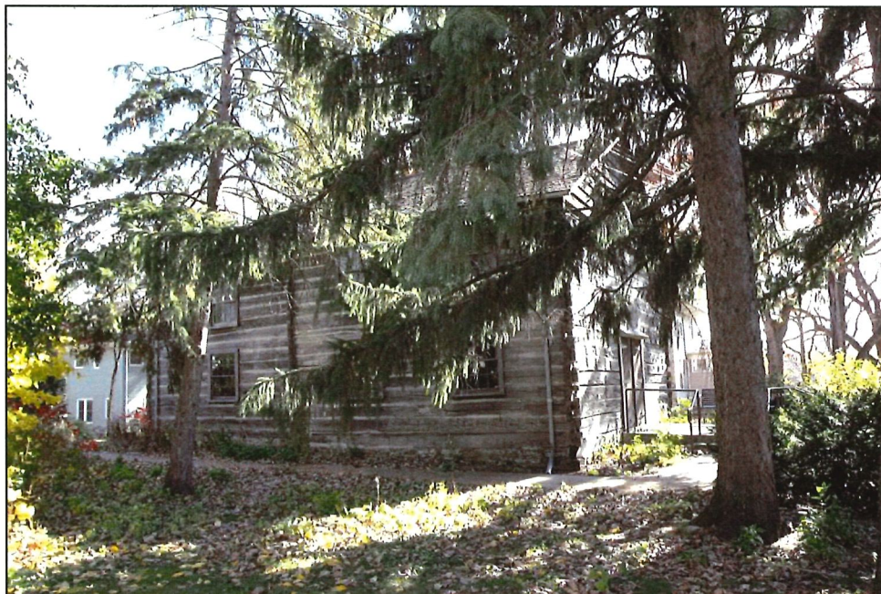
Photograph 4: West and north facades, looking southeast.