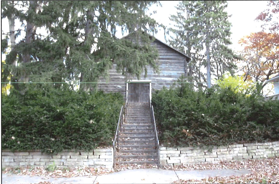
Photograph 1: West (front) facade, looking east.

All photographs were taken by Jessica Berglin on October 23, 2017.