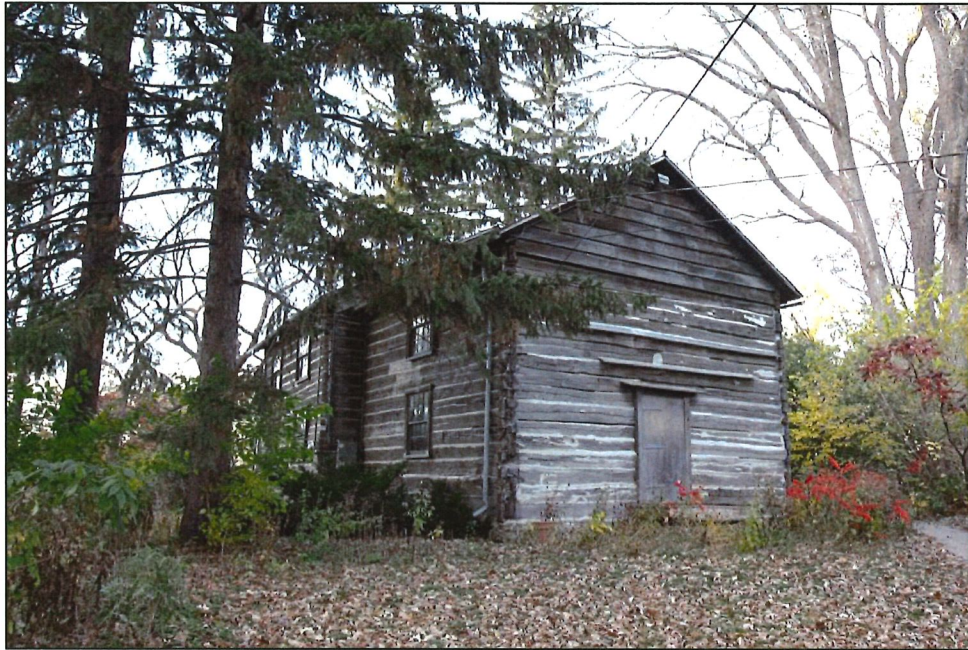
Photograph 3: East (rear) and south facades, looking northwest.