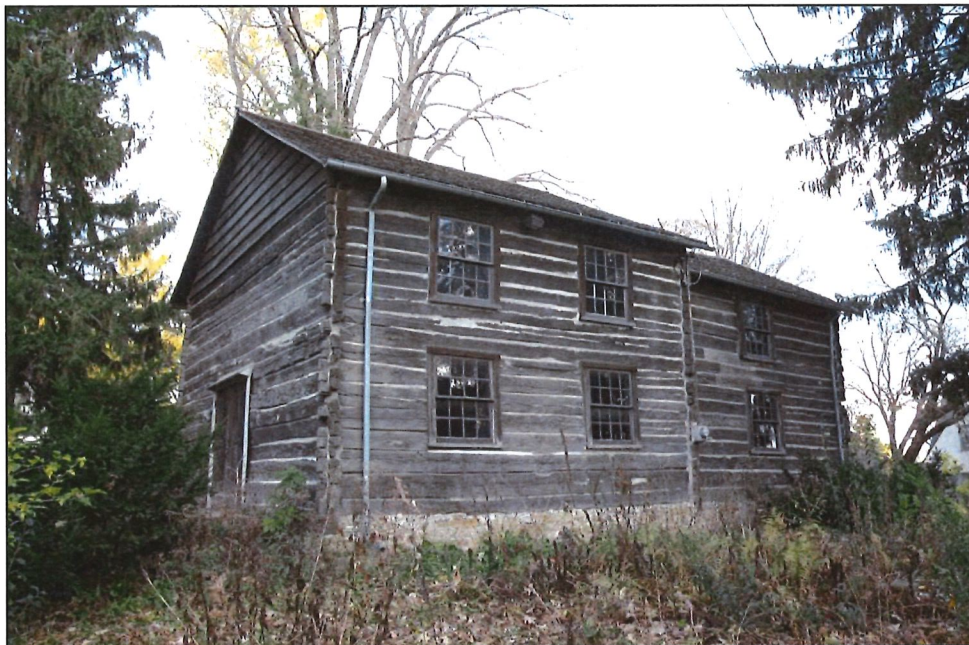
Photograph 2: West and south facades, looking northeast.