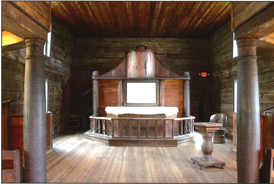
Photograph 6: Chancel with high pulpit and altar, looking east.