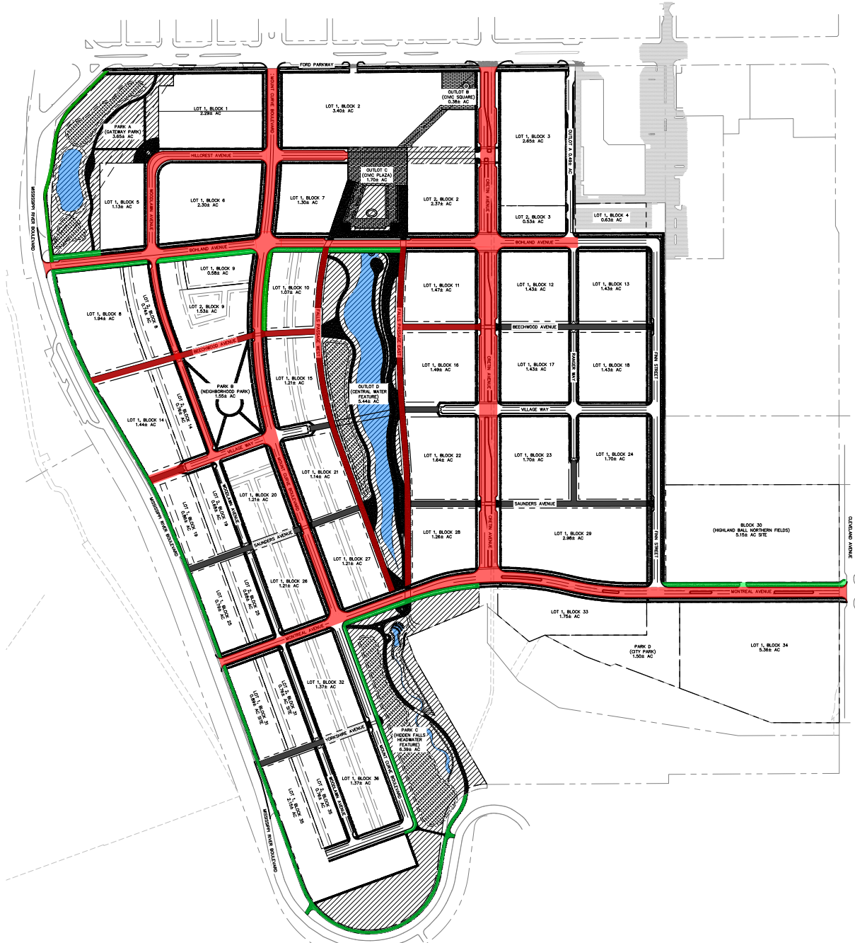
Exhibit B - Current Plans

2021 Complete Streets █ 2021 Complete Sidewalks & Boulevards █