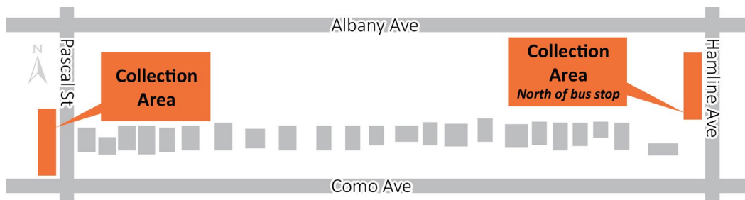
Garbage and recycling collection areas for residents with direct driveway access on Como Avenue