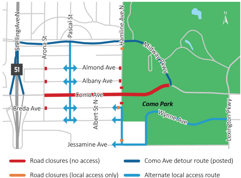
Detour and Access Map Como Avenue and Hamline Avenue intersection detour using Midway Parkway

Beginning Wednesday, September 16, the intersection at Como Avenue and Hamline Avenue will be closed to facilitate reconstruction of the intersection. This closure will last for one week and allow crews to complete storm sewer installation, sanitary sewer repair, water main service repair, hydrant replacement, and curb installation in the intersection. Como Avenue traffic will be detoured to Midway Parkway. Local access will be maintained both from the north and south on Hamline Avenue (see detour map).