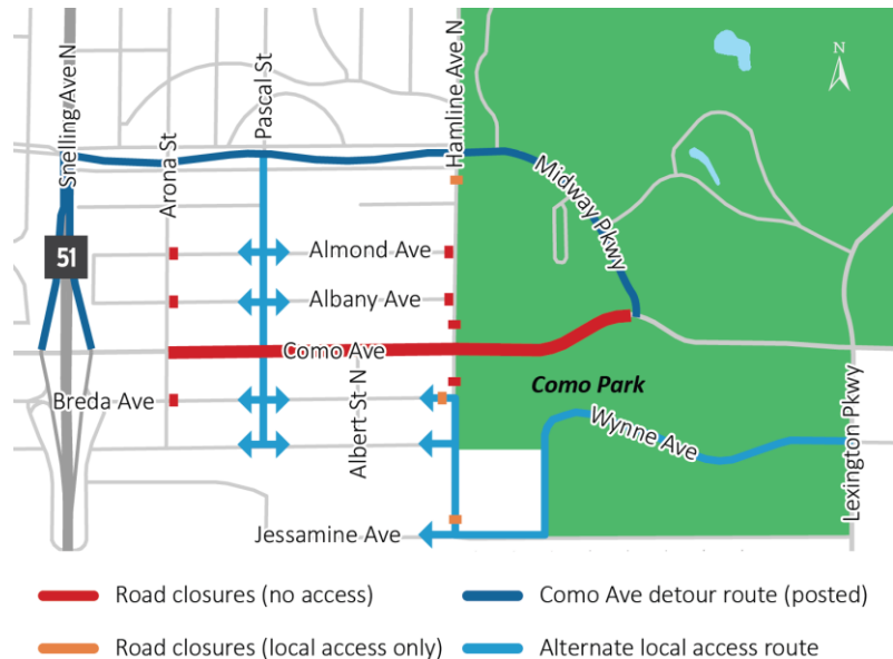
Como Avenue and Hamline Avenue intersection detour using Midway Parkway

A reminder that the intersection at Como Avenue and Hamline Avenue is closed to facilitate reconstruction of the intersection. This closure will last for one week and will allow crews to complete storm sewer installation, sanitary sewer repair, water main service repair, hydrant replacement, and curb installation in the intersection. Como Avenue traffic is detoured to Midway Parkway. Local access is maintained both from the north and south on Hamline Avenue.