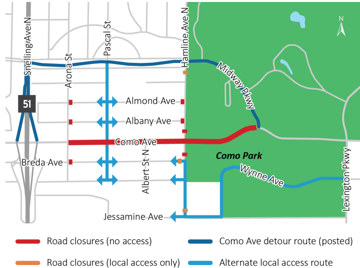
Como Avenue and Hamline Avenue intersection detour using Midway Parkway

The intersection at Como Avenue and Hamline Avenue will be reopened by the end of this week. Crews will be completing pavement and bringing castings up to grade. Work on the sidewalk and curb ramps will continue in the following weeks, with temporary lane closures possible while work is occurring. The final layer of pavement in the intersection will be placed with Como Avenue paving work toward the end of October.