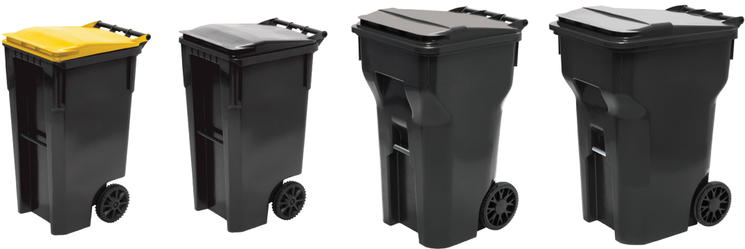
small / every other week small / weekly medium / weekly large / weekly