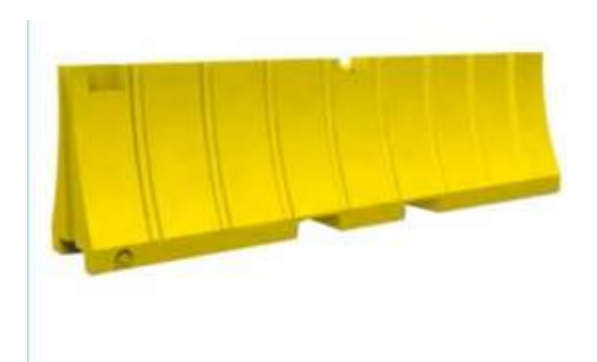
Visual Examples of Acceptable Water Filled Jersey Type Barriers