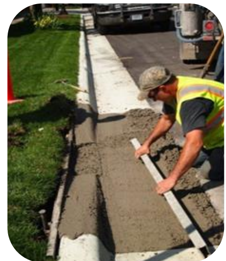
A curb cut must be created; notches are not allowed.

Work on curbs, sidewalks and driveways within the right-of-way must be done under a permit from the Sidewalk Office . If your curb work damages the street, pavement restoration (asphalt and concrete) is performed by the Public Works Street Maintenance Division. Your contractor is responsible for payment to the city for your cost of such restoration.