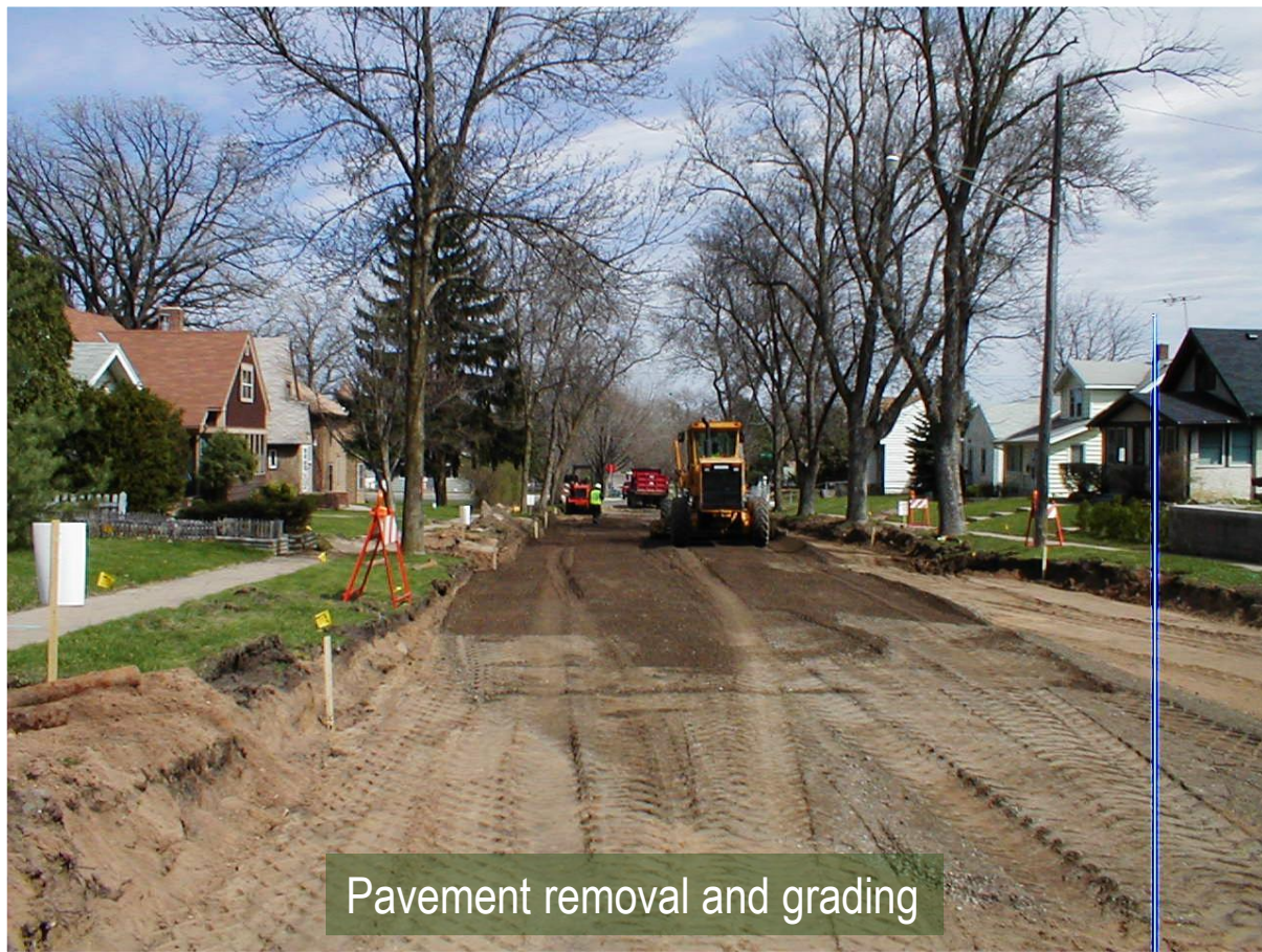
Pavement removal and grading