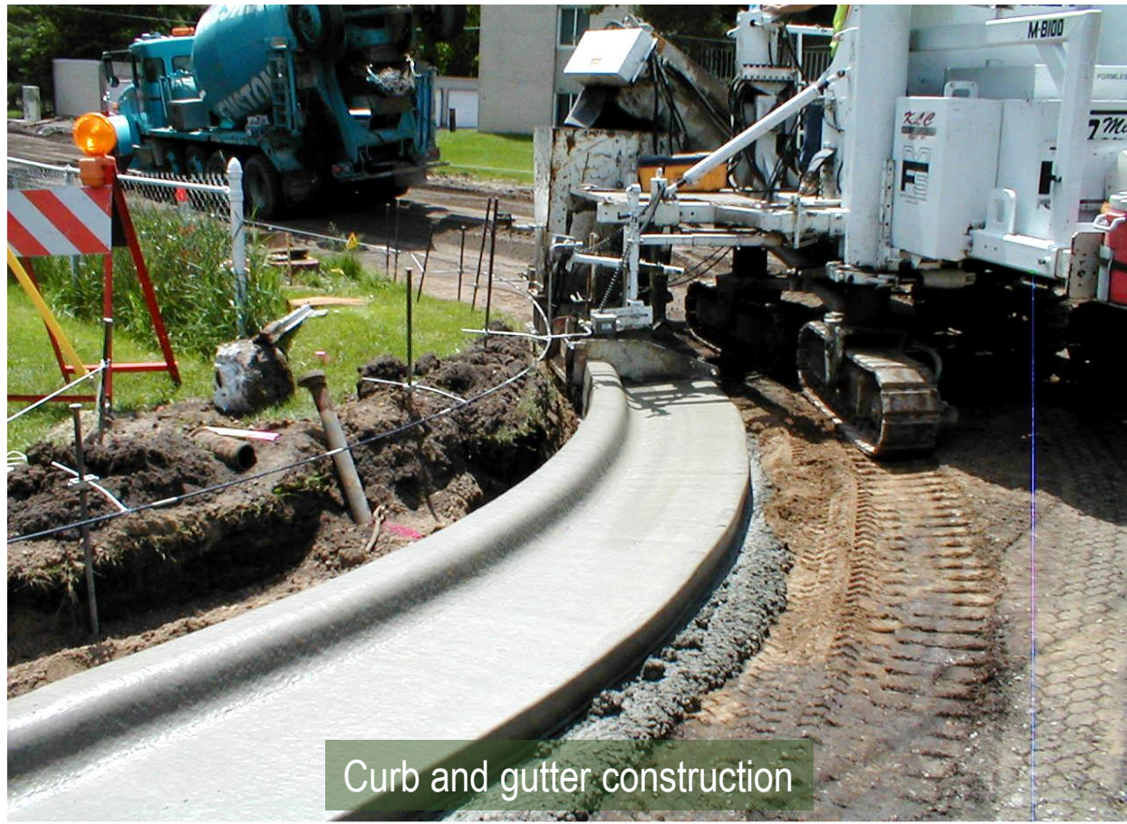
Curb and gutter construction