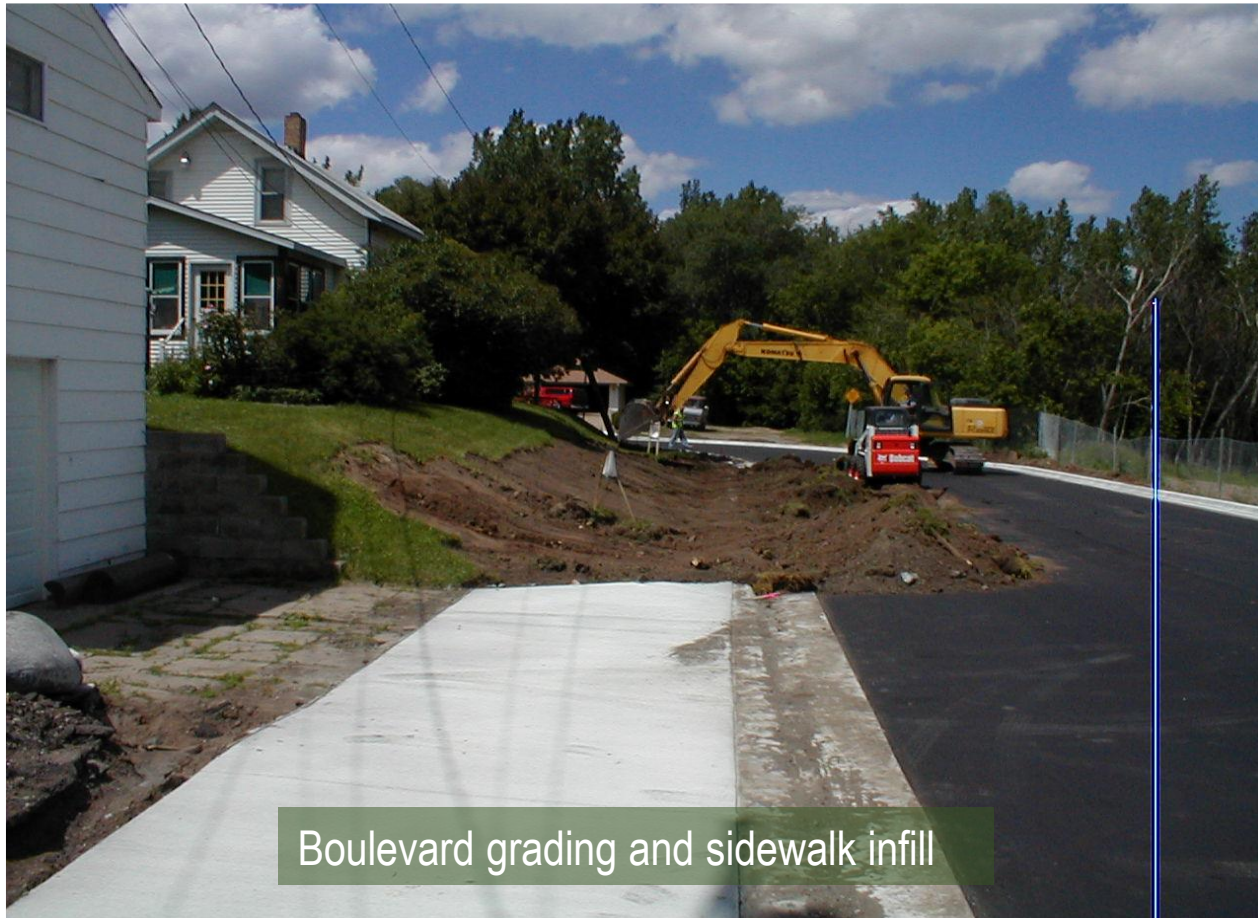
Boulevard grading and sidewalk infill